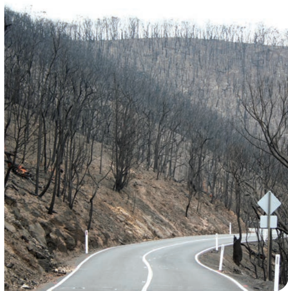
Kinglake Road, Victoria, one week after the February 2009 Black Saturday fires.

'...appropriate use of planned fire to protect communities and their assets, and to protect and conserve natural and cultural values.'