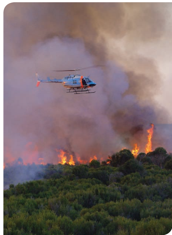
Planned fire in coastal forests using aerial incendiary operations in South Australia, 2001.

Australia plays a significant role within the international bushfire management community. Our achievements in fire research, bushfire mitigation and management, and community involvement, are increasingly influencing approaches to bushfire management worldwide. A clear vision and policy, aimed at improving the management of fire by land and bushfire management agencies and communities, will consolidate this international contribution.