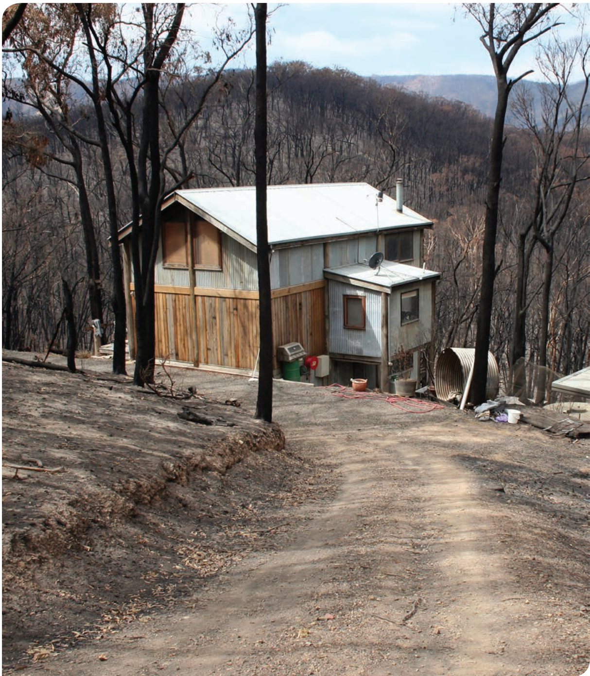
House at Strathewen, Victoria, that was successfully defended in the February 2009 Black Saturday fires.

A subset of forest plant communities in which the trees form only an open canopy (between 20 per cent and 50 per cent crown cover), the intervening area being occupied by lower vegetation, usually grass or scrub.