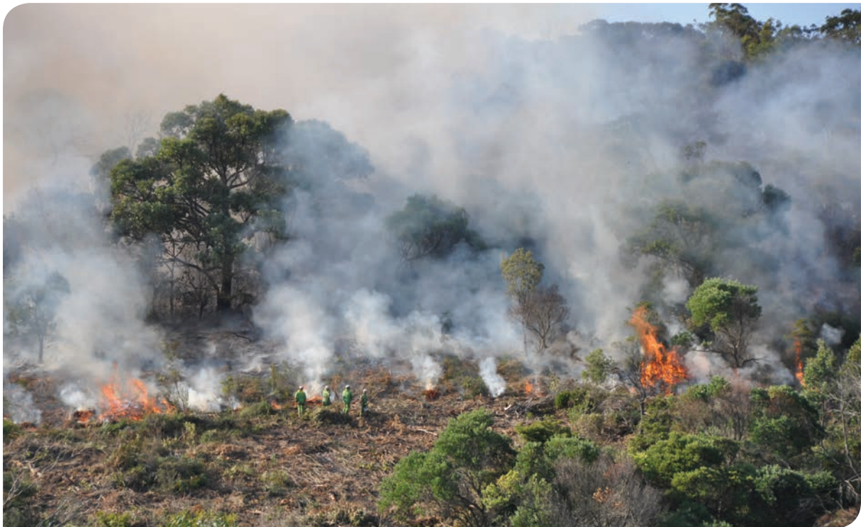
High intensity post harvest slash burn at Rosebud, Victoria, in 2010 to ensure healthy and vigorous regeneration.

Manage planned fire and unplanned fire (where appropriate), to reduce the risk of severe bushfires impacting on communities, and enhance the health, biodiversity and resilience of Australia's forests and rangelands. Underpinning this goal is an understanding that planned and managed fire can play a positive role in reducing the scale and magnitude of bushfires, and promote more healthy and productive forest and rangeland ecosystems.