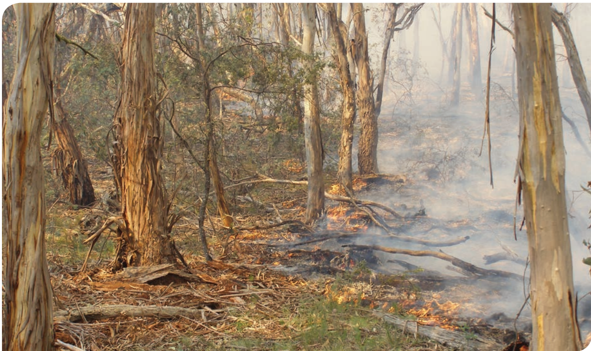
Low intensity fire in long unburnt native forest in Namadgi, ACT, 2009.