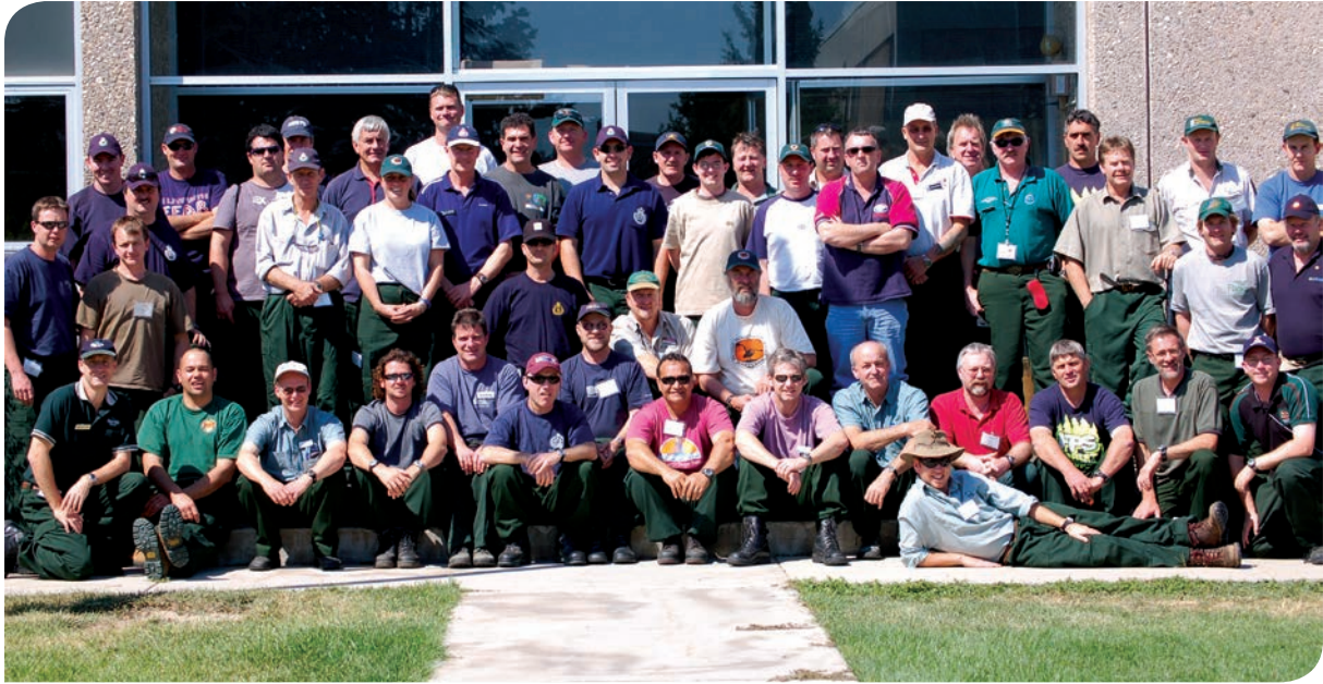
International deployment of Australian/New Zealand fire fighters to the United States of America – Boise, Idaho, August 2006.