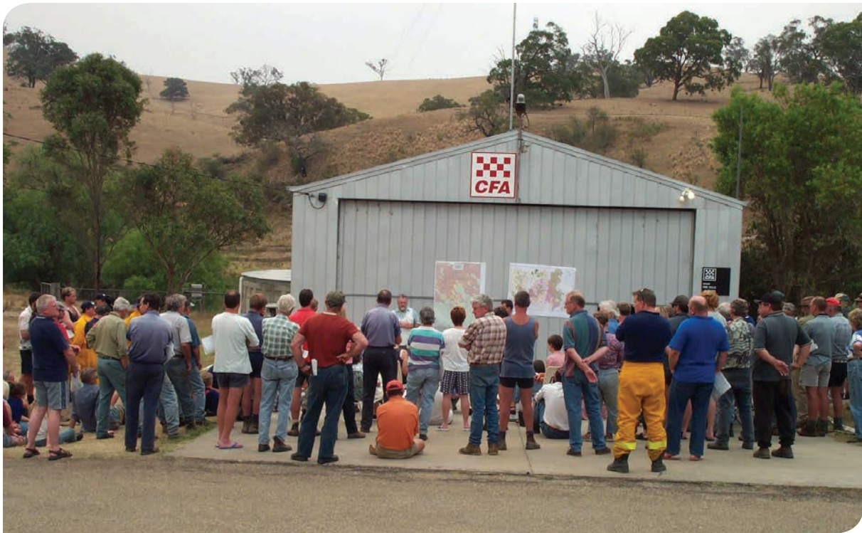
Town meeting at Swifts Creek, Victoria, in February 2003.