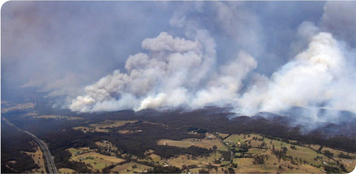
Columns of smoke from burning operations near Mittagong, NSW, during the December 2001 Black Christmas fires.

In northern Australia, few years pass without large areas being burnt. Around 90 per cent of the area of Australia burnt by fire each year is found north of the Tropic of Capricorn, with burning occurring during the dry season, generally between April and November. These fires usually have a relatively low economic impact because of the low population density and the dispersed nature of built assets. Increasingly however, we are gaining a better understanding of the effect of these fires on biodiversity, greenhouse gas emissions and carbon balances. In the grazed rangelands of northern Australia, fire remains both a threat to livelihoods and a valuable tool for managing pastures, weeds and livestock and for maintaining land condition.