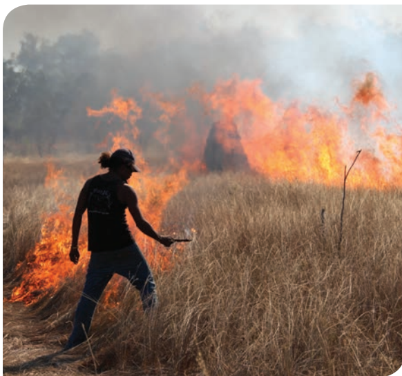
Traditional lighting of the landscape in Cape York, in July 2011.

In the meantime, land and fire managers will not let the lack of a comprehensive framework for planned fire, or short-term and local risks involved in using fire, unduly constrain the use of planned fire to manage the risk of severe fire impacts.