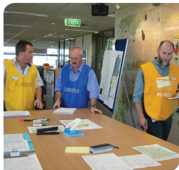
Incident Management Team (IMT) operating at Horsham, Victoria, in 2004.

There needs to be consistency of purpose during bushfire risk mitigation, and unity and clarity of command for all fire response, irrespective of organisational structures.