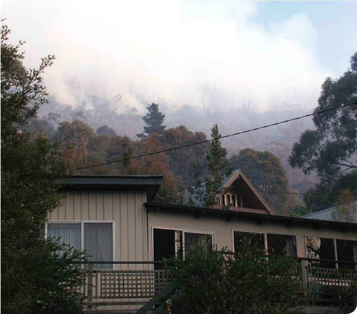
Planned burning to minimise the risk and impact from unplanned fires.

All governments have agreed to take responsibility for implementing this statement. Several of the policies contained within this statement can be implemented immediately; others depend on further work. Reports on the implementation of progress will be prepared by the Forest Fire Management Group – a committee of government officials from production and conservation forest management agencies.