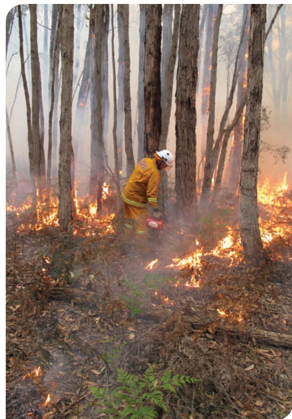
Implementing a planned fire to reduce fuel loads in native forest at Deep Creek, South Australia, in September 2011 (photo: Chantelle O'Brien, Department of Environment, Water and Natural Resources, South Australia).

'...in forest and rangeland ecosystems, reducing the fuel reduces bushfire risk.'