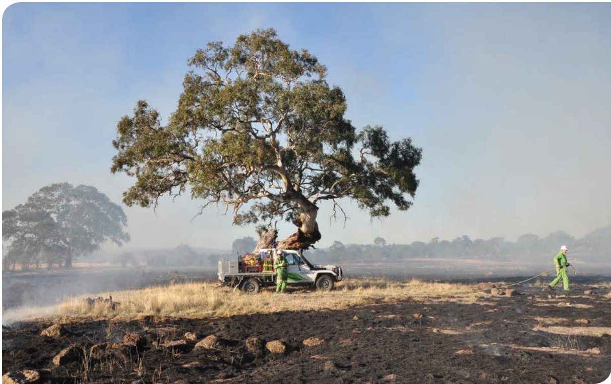
Protection of important remnant vegetation during a 2010 planned fire in Victoria.