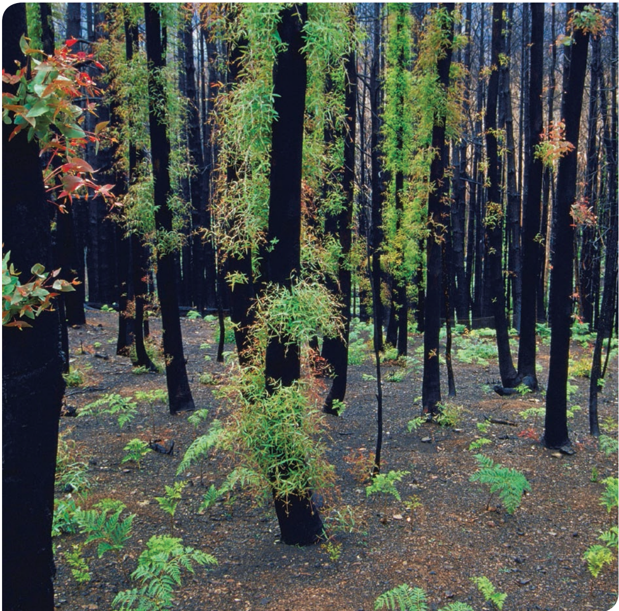
Vigorous native forest epicormic regrowth following a high intensity wild fire.

'...fire can be damaging and devastating in some circumstances, and essential for maintaining productive and healthy landscapes in others.'