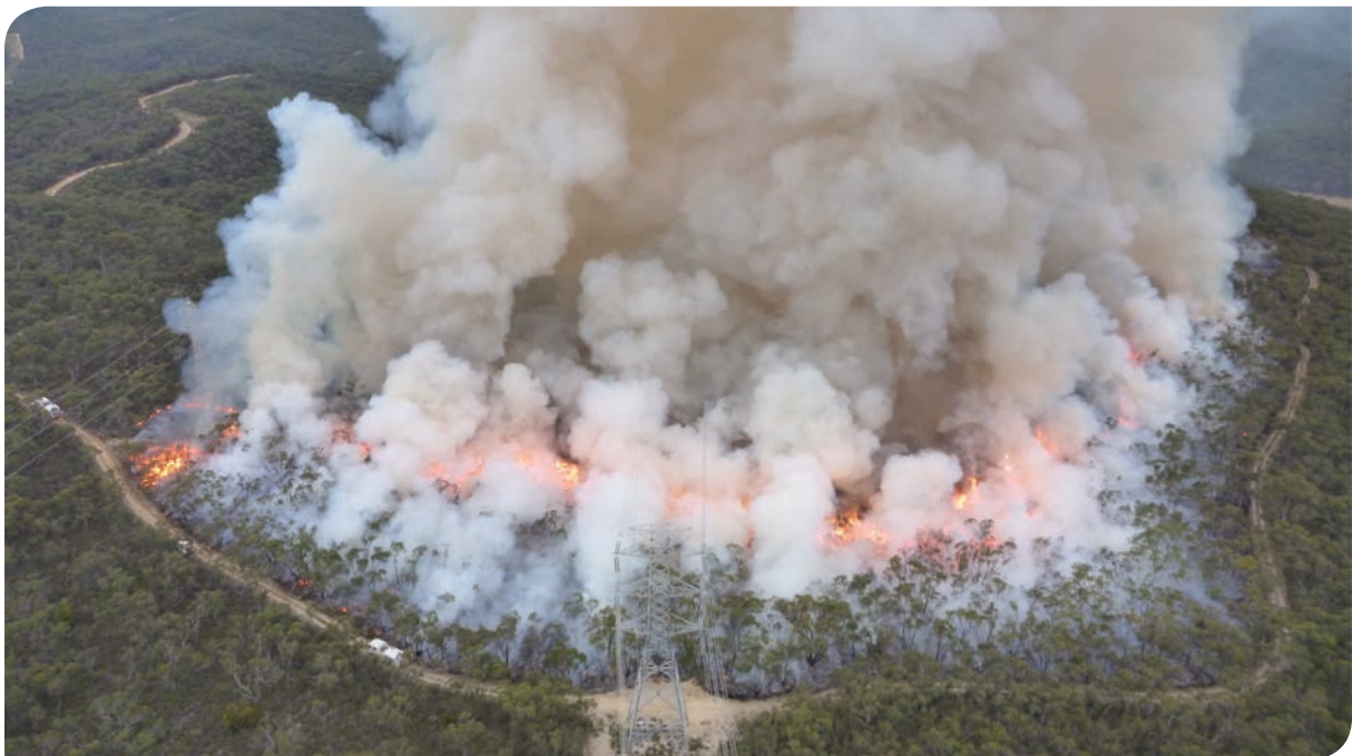
Utilising internal draw and convection currents in a planned fire in South Australia, in 2011 (photo: Chantelle O'Brien, Department of Environment, Water and Natural Resources, South Australia).

A source of potential harm or a situation with potential to cause loss.