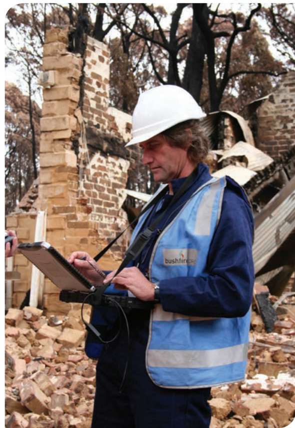
Member of the Bushfire CRC multiagency research task force analysing destroyed properties at Kinglake, Victoria, one week after the February 2009 Black Saturday fires.