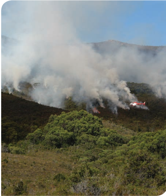
2011 fuel reduction burn at Red Tape Creek, Tas, using aerial incendiaries (photo: Paul Black, Parks & Wildlife Service, Tasmania).