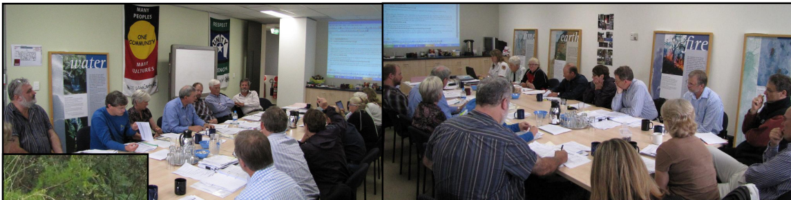
Advisory Committee members and observers, NPWS, Katoomba

The Advisory Committee for the Greater Blue Mountains World Heritage Area (GBMWA) met at the National Parks and Wildlife Service, Blue Mountains Region Office, Katoomba on Friday 5 February 2010 and heard from some of the Region's team about their role in reviewing the Blue Mountains, Kanangra-Boyd and Wollemi Plans of Management, the new EcoPass Commercial Licensing system, and the Discovery Program with its expanded Aboriginal Discovery Ranger program.