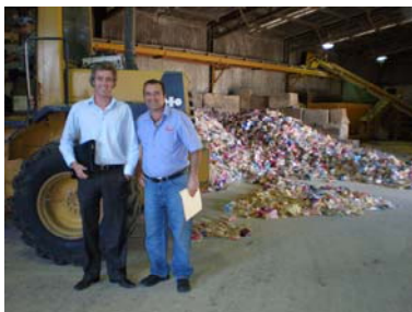
Goodman Fielder now recycles most of its bakery waste.