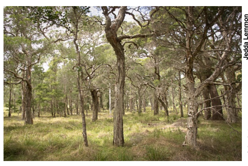
Illawarra Lowlands Grassy Woodlands within a BIO Map core area at Yallah TAFF

BIO Map does not identify all areas of state or regional priority; nor does it identify areas of local value. Groups working outside identified PIAs continue to provide positive benefits for biodiversity within the study area.