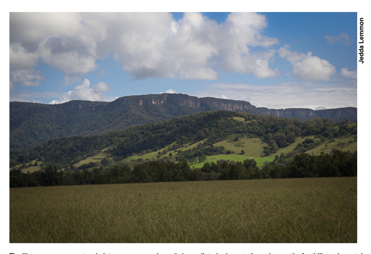
The Illawarra escarpment and plateau are covered mostly by undisturbed vegetation, whereas the foothills and coastal plain are highly cleared and fragmented.

The final Illawarra BIO Map is presented in Figure 2. The map shows core areas and the network of regional biodiversity corridors within the Illawarra region. The total area represented within the mapped PIAs is 66 827 hectares, comprising 13 980 hectares of core area and 52 847 hectares of corridors. This represents about 59% of the Illawarra region.