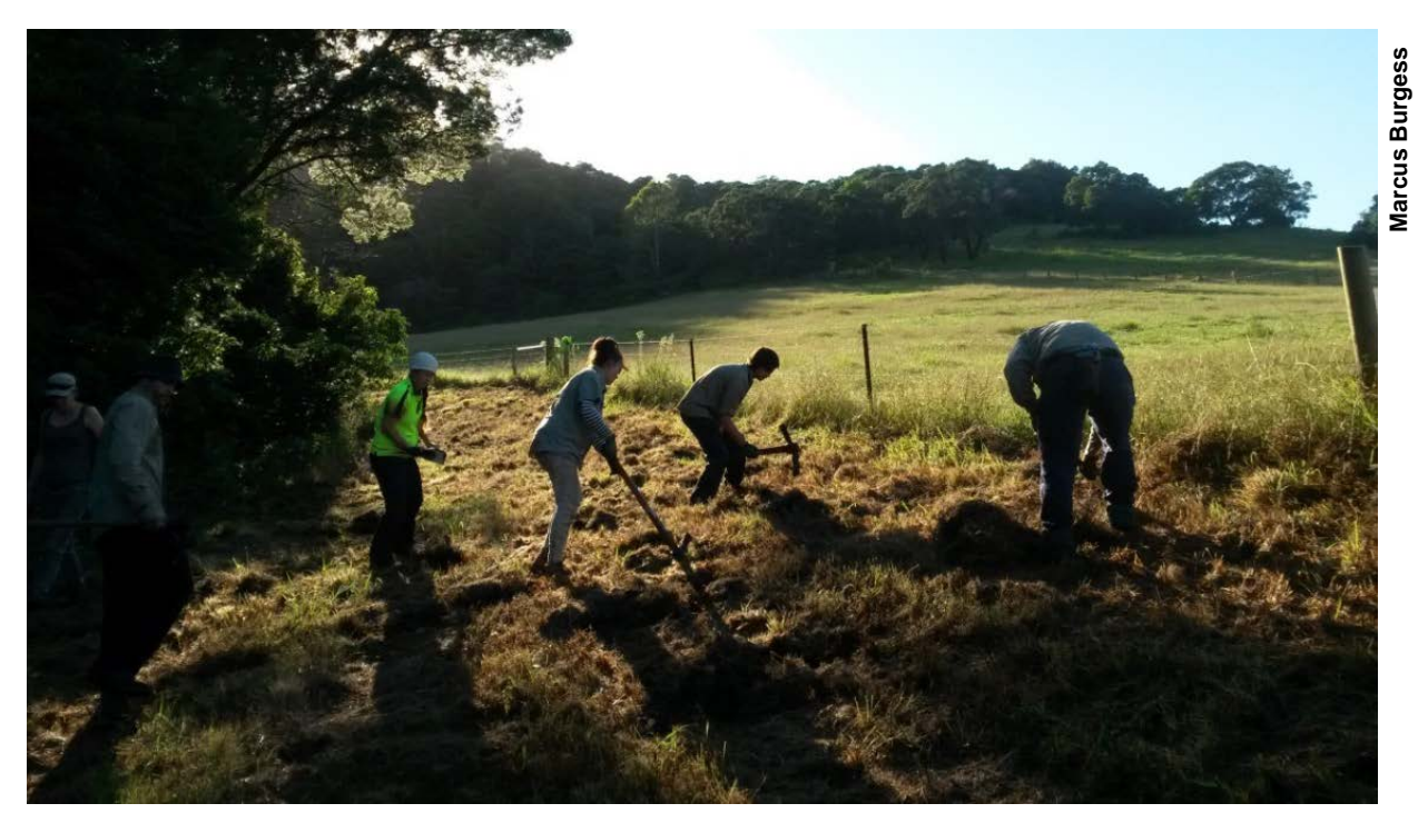
Bush regenerators working at Frazer's Creek, Croom Road.

The representation of many Threatened Ecological Communities within PIAs was significantly increased through the inclusion of large areas of vegetation in the regional corridors. (See Table 2 in section 5.)