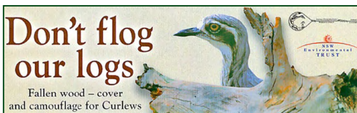
Bush Stone-curlew sticker

A community awareness program was undertaken which included radio interviews, school visits, farm field days, individual landholder visits and a curlew summit. Educational materials were also produced to support the awareness program and included information pamphlets, posters, stickers, t-shirts and a Bush Stone-curlew puppet that made a curlew call.