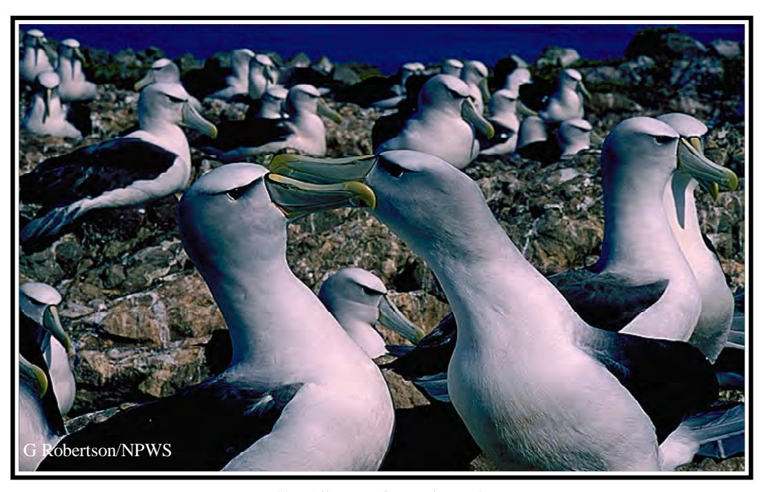
Shy Albatross in nesting colony

A recovery plan has not been prepared for the Shy Albatross.