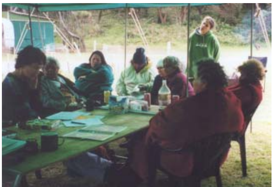
Djuwin Women's Lore Council May Camp at Beachcombers Holiday Park