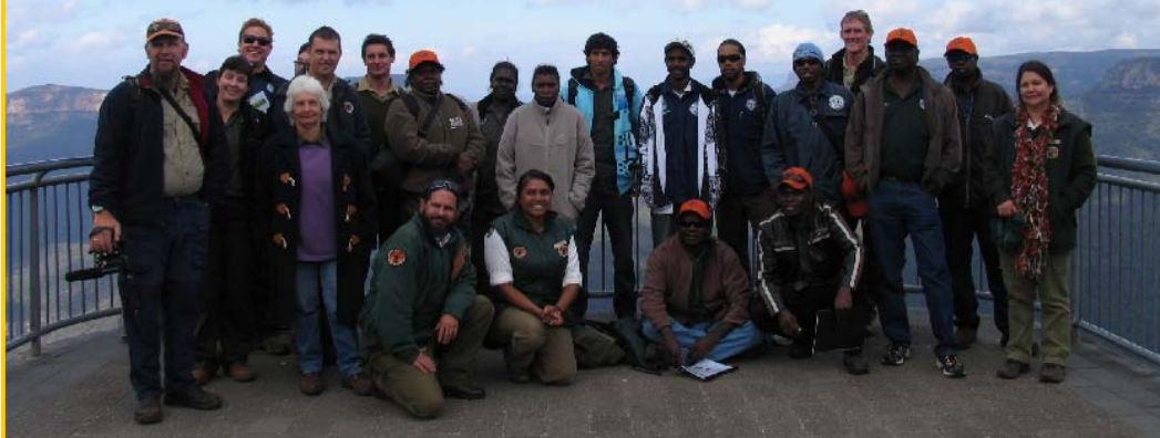
Members of the Dhimurru Land Management group with Blue Mountains Regional Staff