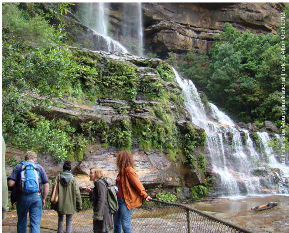
Katoomba Falls, Blue Mountains National Park, S. Alton OEH 2012

By car or coach drive west of Sydney for 100 kilometres to Katoomba. Follow the signs to the Echo Point.