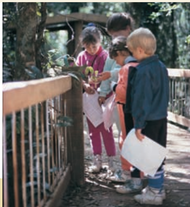
J Nobes © DEC

Dorrigo National Park is one of Australia's most accessible World Heritage Areas. A short stroll takes visitors into the tranquil rainforest and longer walks lead to stunning waterfalls. Visitors can find out more about the rainforest on a Discovery tour or be delighted by early morning encounters with lyrebirds, rainforest pigeons, noisy pittas and colourful parrots, while red-necked pademelons can be seen grazing in the picnic areas at dusk.