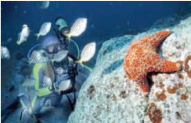
The diverse marine life of Cape Byron Marine Park includes many species of dolphins, seabirds and fish, as well as threatened little terns and leatherback turtles. Cape Byron is a multiple-use marine park that includes protected areas where fishing and collecting is prohibited, and general use areas that support ecologically sustainable commercial and recreational fishing.