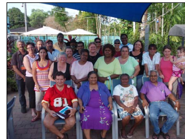
AWHIN representatives from World Heritage Properties around Australia with local Traditional Owners and agency staff, Cairns QLD.

After a very busy agenda, we all boarded a bus and headed south to the little town of Cardwell for the ILS conference. The Girringun Aboriginal Corporation, representing the interests of nine tribal groups of the region, hosted the conference where we were welcomed in the Girramay language. The following four days included plenary sessions, work shops and case studies surrounding Indigenous land and sea management issues and opportunities. The conference was attended by the largest gathering of traditional owners in 2007 and all agreed it was a huge success. The five AWHIN representatives all found the conferences very relevant to Co-management of the GBMWA and grateful for the opportunity to learn about and share knowledge of Country.