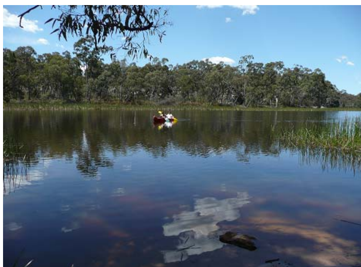
The weather and water were perfect for a paddle at Ganguddy