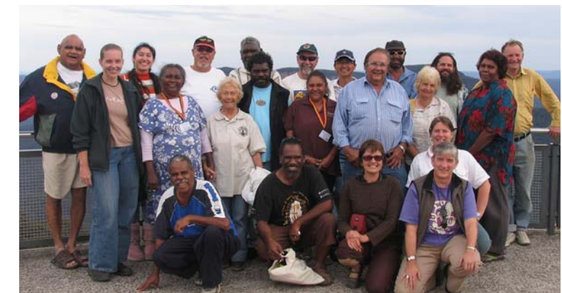
AWHIN Delegates at Echo Point, Katoomba