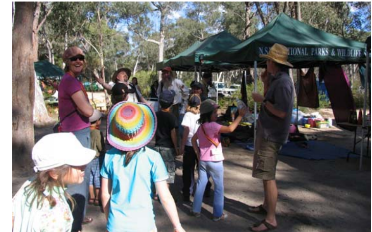
Kids enjoyed the variety of activities at the Camp