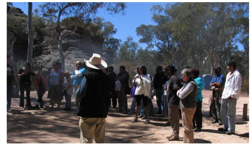
AWHIN delegates arrive at the camp for smoking ceremony.

Check out the www.livingcountry.com.au website for more pictures!