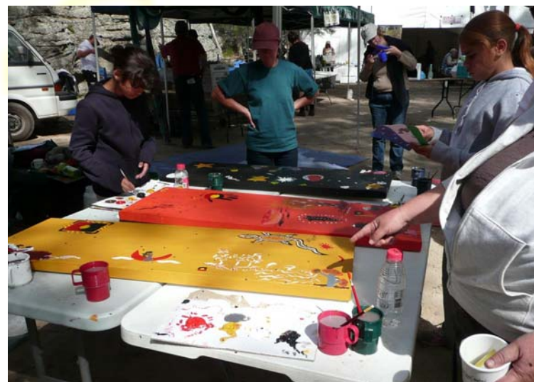
Campers were invited to create a commemorative artwork