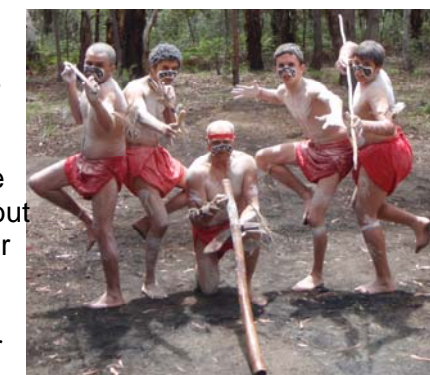
Wiradjuri Dancers at the Celebration on Saturday 8 November

An important aspect of local Aboriginal history, just north of Lithgow, has been officially recognised as an Aboriginal Place – granting it additional protection under the National Parks and Wildlife Act and assuring the Wiradjuri people an ongoing link with their cultural heritage. Blackfellows Hand Shelter is the 40 th Aboriginal place to be declared by the NSW Government in the past 10 years. There are currently 65 Aboriginal places across NSW, with a number of other potential places being investigated. Declaration of an Aboriginal place doesn't change the status of the land but may limit use as far as preventing activities that may destroy damage or deface the Aboriginal Place.