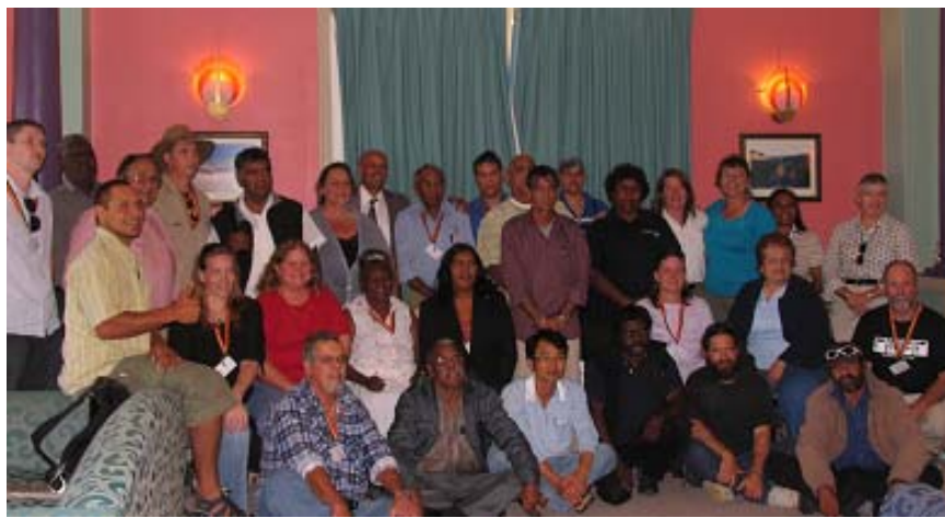
AWHIN delegates at Katoomba