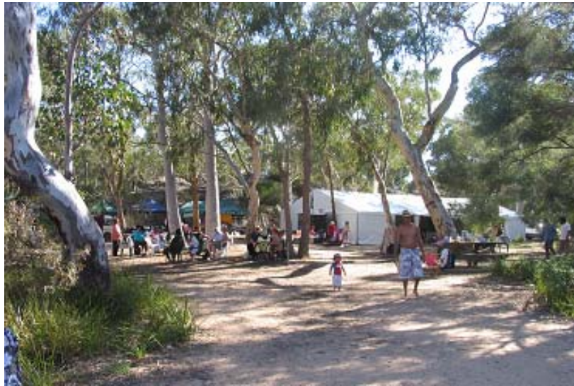
Main camp site, Ganguddy

AWHIN delegates who are the Traditional Custodians from World Heritage properties across Australia visited the GBMWSHA from Thursday the 23 rd to Monday the 27 th October 2008. Greater Blue Mountains AWHIN and Aboriginal Reference Group representatives hosted this year's conference with delegates attending from World Heritage Areas including the Wet Tropics, Fraser Island, Gondwana Rainforest, Shark Bay, Kakadu, Tasmanian Wilderness, Purnululu, Riversleigh, Willandra Lakes and Great Barrier Reef. After arriving in Sydney, delegates made their way to Katoomba for the conference held at the Youth Hostel on the Friday. A Welcome to Country and AWHIN dinner was held that night at the Carrington Hotel with local Gundungurra and Darug Community Elders and members along with local dignitaries.