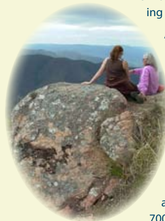
▲ Lucifers Thumb