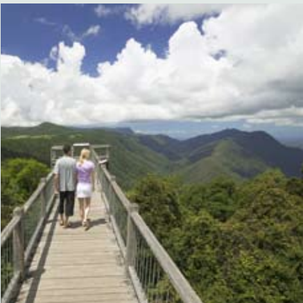
Skywalk boardwalk at Dorrigo National Park