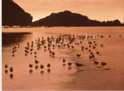
▲ Sandon sunrise, Yuraygir National Park