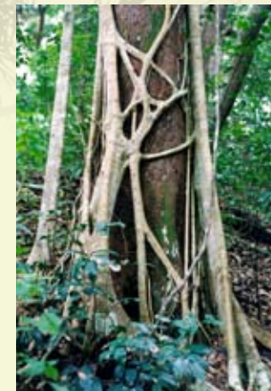
▲ Strangler figs are a feature of the Iluka Rainforest