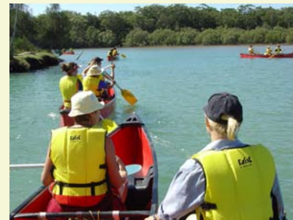
▲ Canoeing at Moonee Beach Nature Reserve

Dorrigo Rainforest Centre Dome Road, (PO Box 170), Dorrigo, 2453 Ph: (02) 6657 2309