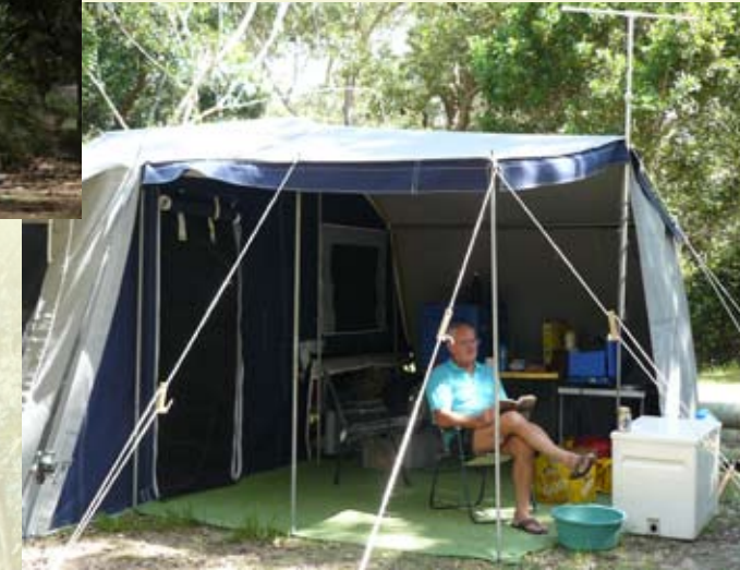
▲ Camping at Station Creek, Yuraygir National Park