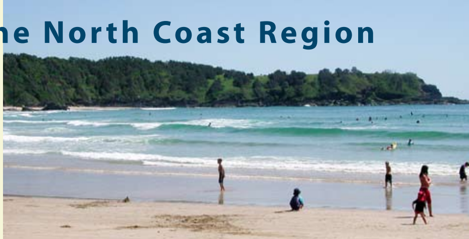
▲ Diggers Beach in Coffs Coast Regional Park

There are more than 80 parks and reserves in the region, totalling over 380,000 hectares. They are home to a stunning diversity of plants and animals, including many threatened species.