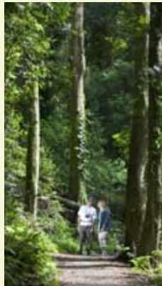
▲ Dorrigo National Park

The Gondwana Rainforests of Australia World Heritage Area comprises more than 50 individual reserves in north-eastern NSW and south-eastern Queensland, containing subtropical, warm temperate and Antarctic beech cool temperate rainforest.