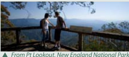
▲ From Pt Lookout, New England National Park