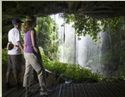
◀ Crystal Shower Falls veils lush rainforest along Wonga Walk in Dorrigo National Park

Catbirds will trick you with their calls and colourful fungi charm you. Walk with the Birds boardwalk provides a great vantage point to study birdlife and two splashing waterfalls provide delightful sunlit resting spots.