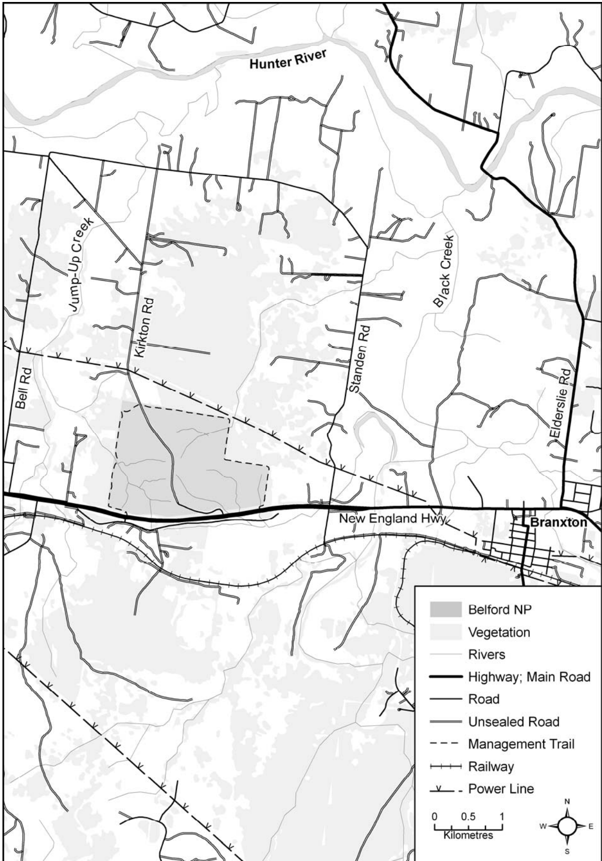
MAP 2. LOCAL SETTING