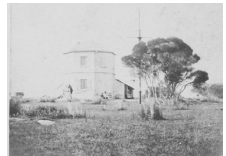
Macquarie Watchtower (c.1860-1870). Showing native trees and grasses creating a natural boundary to the area