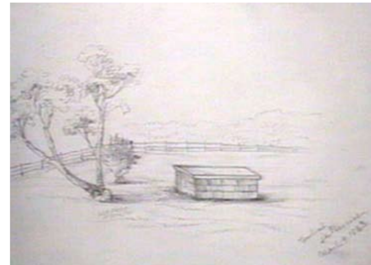
Grave of Pere Receveur (date unknown). Showing stone coursing to tomb & native tree planted within wider picket fencing