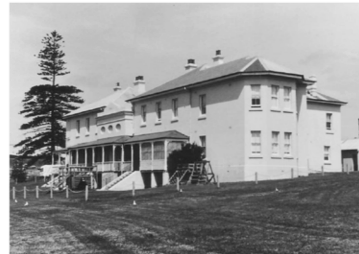
Cable Station (date unknown). Showing building painted white with play equipment in the foreground (Randwick City Council Heritage List)