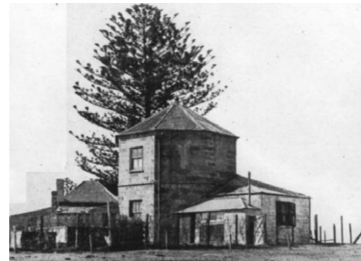
Macquarie Watchtower (date unknown). Showing Norfolk Island Pine tree planting to north of Headland.