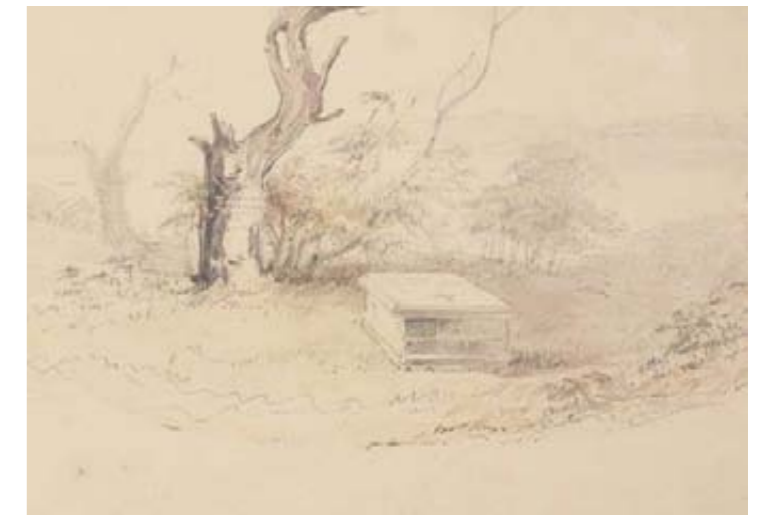
Grave of Pere Receveur (Nov 1842). Sketch by Oswald W.B Brierly, showing tree plantings close to tomb and shrub planting hugging the opposite boundary (SLNSW ML ZDG 19/f.2)