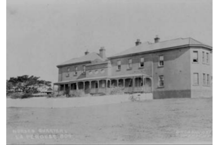
Cable Station c. 1900-1927. Showing picket fence boundary treatment around the front lawns