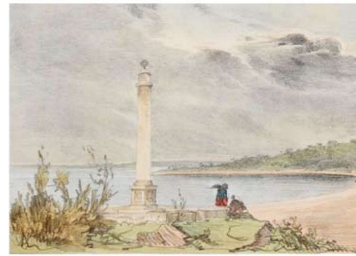
La Perouse Monument c. 1836. Sketch by John Gardiner showing shrub planting behind Monument