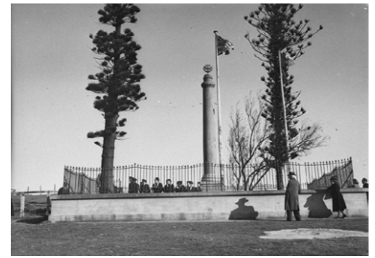
La Perouse Monument c. 1920. Showing Pines planted within Monument walls.