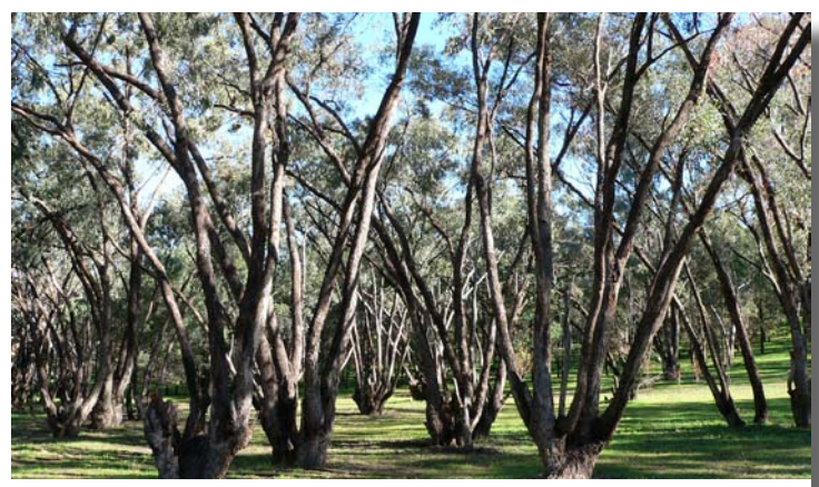
Fuzzy Box Woodland in Weddin Mountains National Park, with low herbaceous and grassy groundcover

The NSW Scientific Committee defines a particular area as the Bioregion and Local Government Area where an EEC may be found. The particular area may be further delineated by using other supplementary factors such as landscape, soil type and climatic variables.