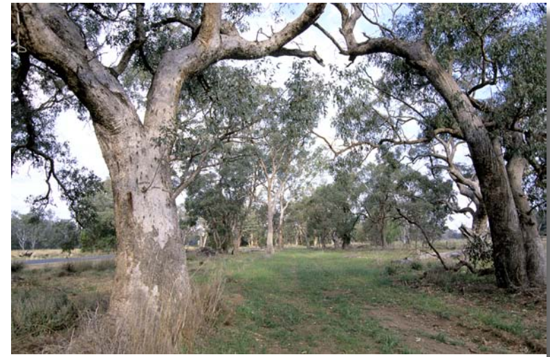
Fuzzy Box Woodland roadside remnant