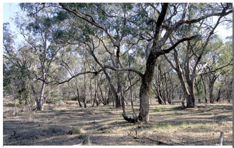
Fuzzy Box Woodland roadside remnant at Emu Creek, south of Grenfell

Small trees and shrubs that may be present in the understorey include: wilga (Geijera parviflora), Deane's wattle (Acacia deanei), hop bush (Dodonaea viscosa), hickory wattle (Acacia implexa), silver cassia (Senna artemisioides sens. lat.), dolly bush (Cassinia aculeata), water bush (Myoporum montanum), eastern cottonbush (Maireana microphylla) and black roly-poly (Sclerolaena muricata).