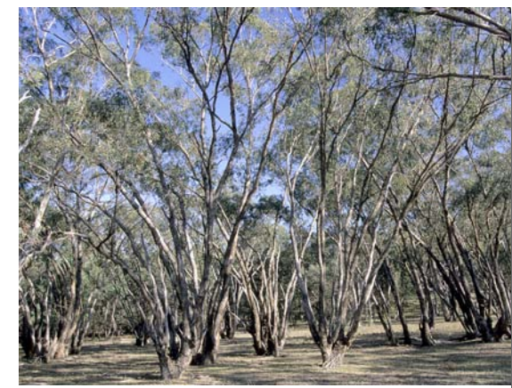
Fuzzy Box Woodland

Any native vegetation remnant has habitat value and contributes to regional biodiversity. It is important to take these factors into account when determining the conservation significance of remnants.