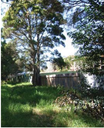
Suburban back gardens meet bushland. Here, neighbours must take care to keep the bush protected from weeds.