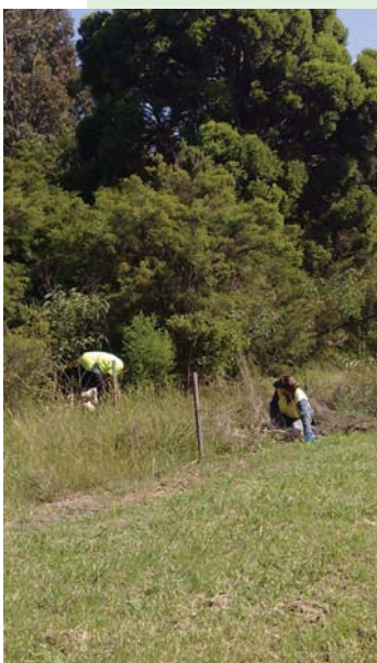
Bush regenerators at work at Coxs Creek Bushland Reserve

aethiopicus ), and grasses such as kikuyu ( Pennisetum clandestinum ), common couch ( Cynodon dactyl ) and panic grass ( Ehrharta erecta ) were also abundant. Blackberry ( Rubus fruticosus ) is still present on the creek banks and in the drainage swales, while introduced vines such as moth vine ( Araujia sericifera ) and bridal creeper ( Myrsiphyllum asparagoides ) are widespread in the core bushland. Regular bush regeneration activities have been undertaken by Council staff, contractors and volunteers since 1996 to manage these weeds.