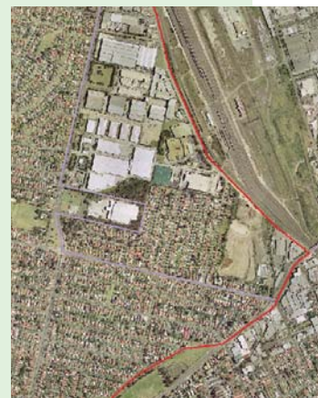
Greenacre in 1943 (top) and 2007 (below). In 64 years, the already greatly reduced native forest of the area had almost completely disappeared.