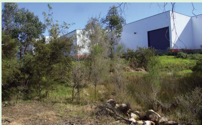
Cook River Castlereagh Ironbark Forest shrub species grow along the banks of Coxs Creek just a few metres away from industry.