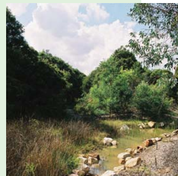
Frogs inhabit ponds along the intermittent stream of Coxs Creek. Bush regenerators ensure that these ponds are kept in a natural state.

Introduced plants included woody weeds such as green cestrum ( Cestrum parqui ) and Mickey Mouse bush ( Ochna serrulata ) which previously dominated the mid-storey. Ground covers such as ground asparagus ( Protasparagus