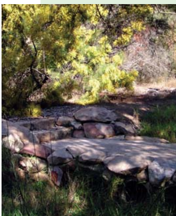
This bridge across Coxs Creek is designed to blend into the natural landscape.