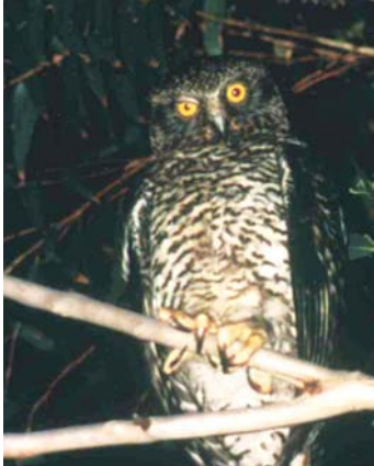
Powerful Owls shelter in Cooks River Castlereagh Ironbark Forest.

Wianamatta Shales soils. Where soil is shallower or more moist, other plant communities can arise in pockets or adjacent to Cooks River Castlereagh Ironbark Forest, such as shale-gravel transition forest, Castlereagh swamp woodland and Castlereagh scribbly gum woodland.