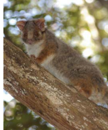
Common ringtail possum