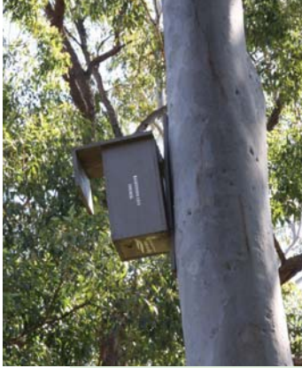
A nesting box in Roberts Road Reserve.