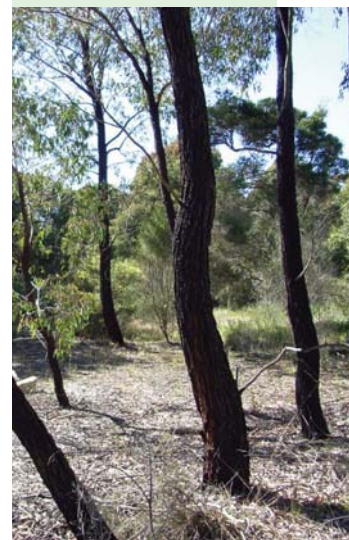
Ironbark trees at Cocks Creek Bushland Reserve

Cooks River Castlereagh Ironbark Forest is a unique ecological community of trees, shrubs, grasses and groundcovers native to the Sydney Basin Bioregion. It was once common in Sydney's western and south western districts, in areas with clay soils derived from the nutrient-rich alluvial deposits of ancient river systems, or on