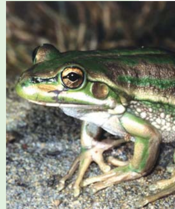
Green and golden bell frog

The green and golden bell frog was once among the most common species of frog throughout the most populated areas of Sydney. Today, it is one of the most threatened. These frogs have been seen in Coxs Creek Bushland Reserve in recent years, but only in small numbers. In some years, they cannot be found at all. Such fluctuations would have been a natural occurrence before the human settlement of the region, when frogs would have occasionally become extinct in some ponds while recolonising others. A plan of management is in place to try to ensure that the green and golden bell frog persists in the vicinity of the Coxs Creek Bushland Reserve (DECC 2007).