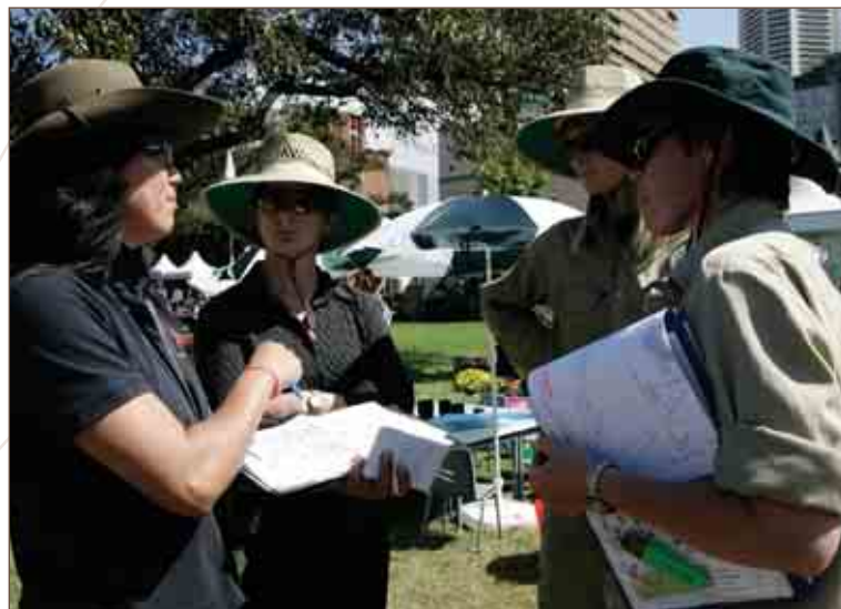
Briefing the team at Sydney in Bloom

Give staff/volunteers the responsibility for managing their delegated areas and have them report back to you or your designated Waste Wise Manager.