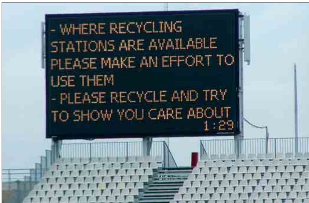
Promoting the Waste Wise message at the Big Day Out in Sydney