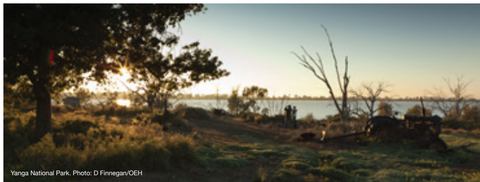
Yanga National Park.

*All information in this guide was correct at the time of publishing, but it is subject to change. For the most up-to-date information visit nationalparks.nsw.gov.au or call 13000 PARKS (13000 72757). An explanation of all symbols has been provided on page 9 of this guide.