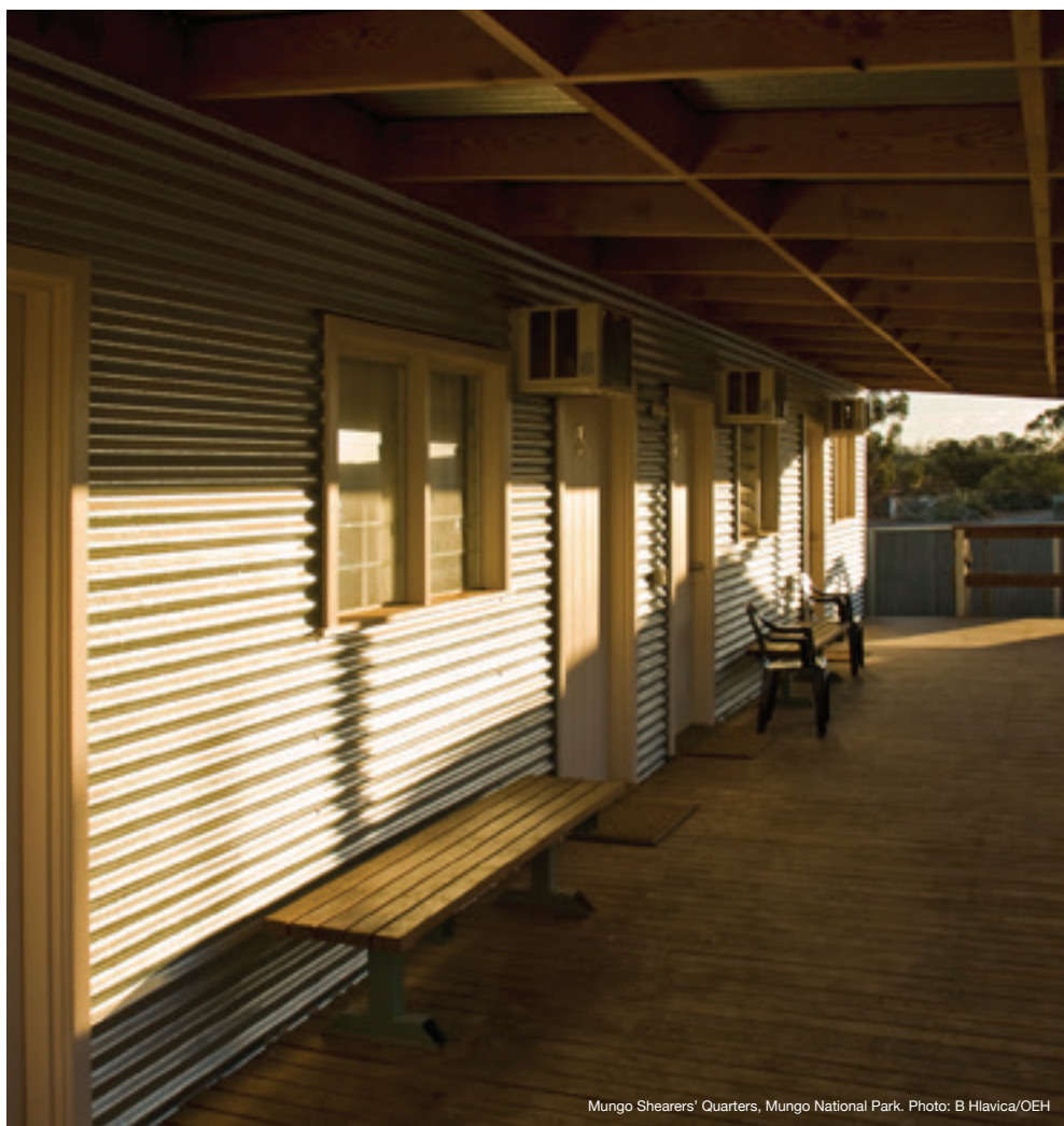
Mungo Shearers' Quarters, Mungo National Park.

Call 13000 PARKS (13000 72757) or visit nationalparks.nsw.gov.au/bookings .