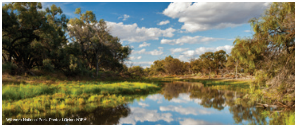
Wilandra National Park.

Known as Kengal to the local Wiradjuri people, The Rock towers 250m over the surrounding countryside, and is thought to have been an important ceremonial site. The reserve is an island of natural habitat for native animals, including the turquoise parrot and glossy black cockatoo.