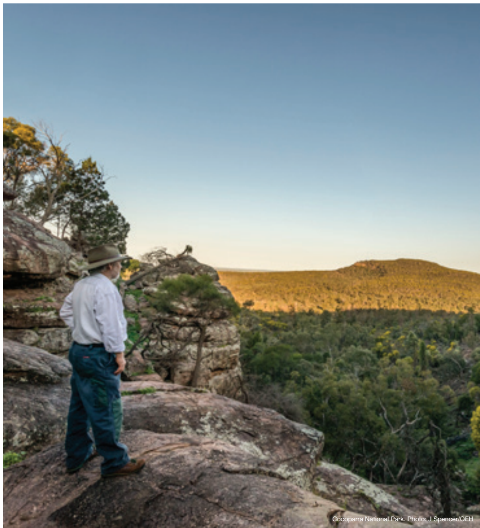
Cocoparra National Park.