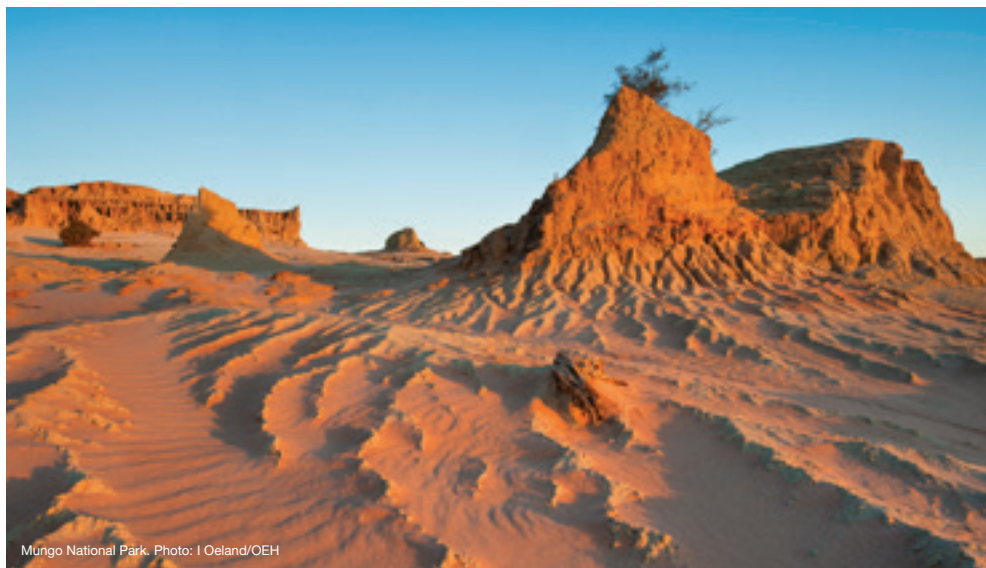
Mungo National Park.

Access: 30km south of Wagga Wagga and 10km east of Mangoplah. The northern end of the park can be reached via Holbrook Wagga Road for