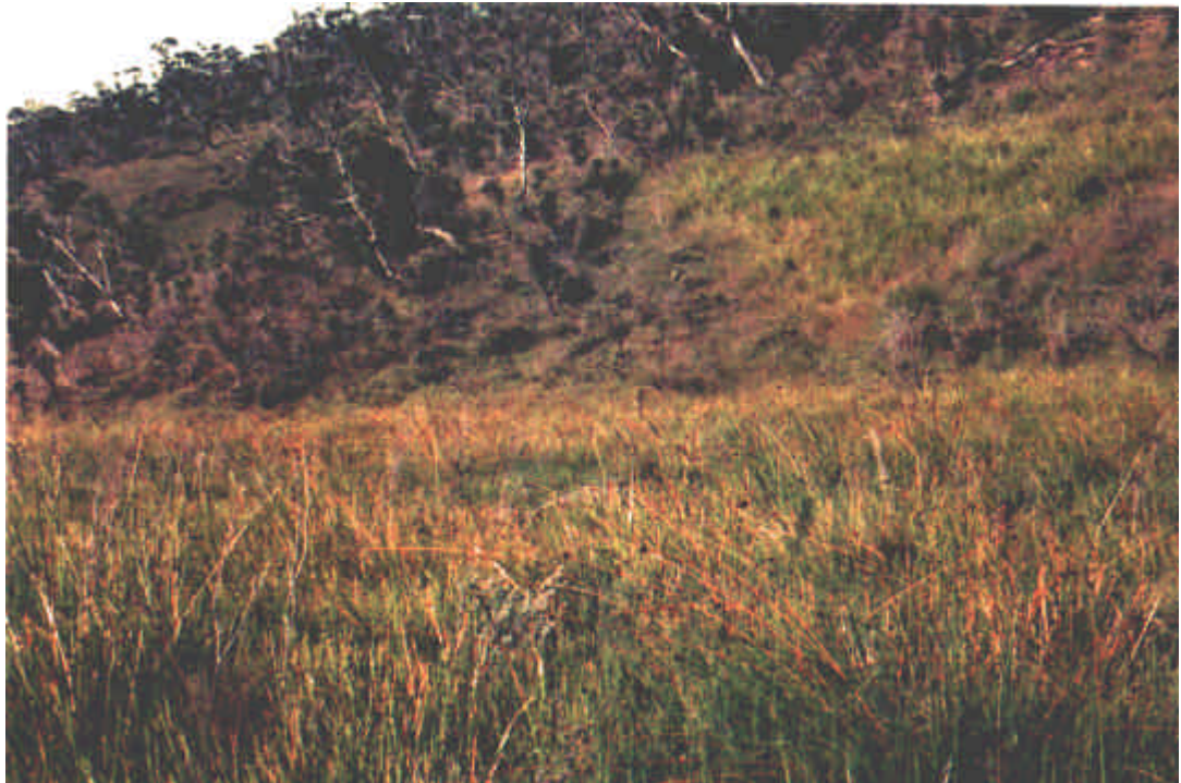
Figure 5. Site 8. Example of narrow valley swamp habitat of the Blue Mountains Water skink