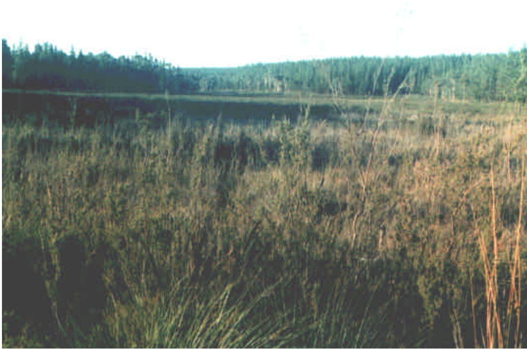
Figure 6. Site 6. Example of low-lying flat swamp habitat of the Blue Mountains Water skink