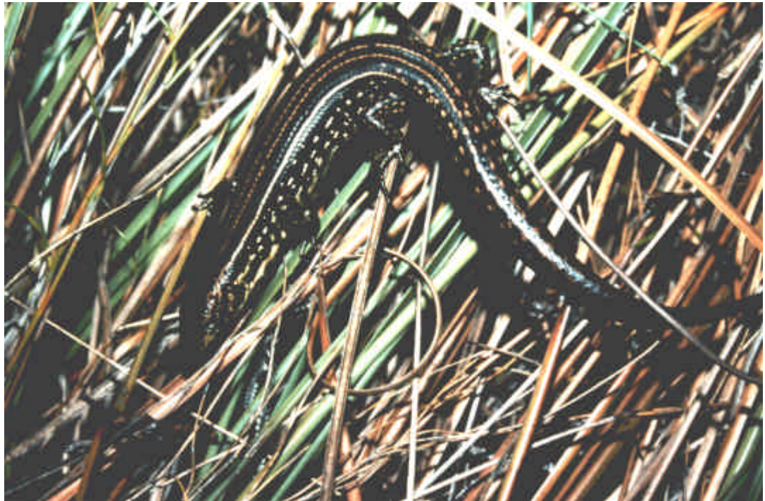
Figure 1. The Blue Mountains Water Skink Eulamprus leuraensis

The body of the Blue Mountains Water Skink is much darker than the other species of Eulamprus found in the Blue Mountains. Across its back it is very dark brown to black with narrow yellow/bronze to white stripes along its length to the beginning of the tail and continuing along the tail as a series of spots (Figure 1). This gives the appearance of a distinctive dark dorsal stripe bordered by yellow lines. The limbs and sides are also dark brown to black with yellow to bronze streaks and small blotches. The head is brown to bronze with black flecks and there are short streaks on the side of the head between the ear and the front legs. The ventral surface and chin is cream to golden yellow with small dark blotches. There is occasionally a ventral green or bluish sheen, especially in juveniles and on the necks of some adults (LeBreton pers. comm. 1999). The limbs are well developed and all have five digits. The taxonomic description for this species can be found in Shea and Peterson (1985). The description of this species in Cogger (1996) includes a colour photograph.