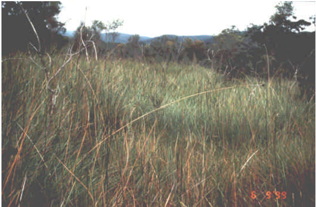
Figure 4. Site 26. Example of perched headwater swamp habitat of the Blue Mountains Water Skink