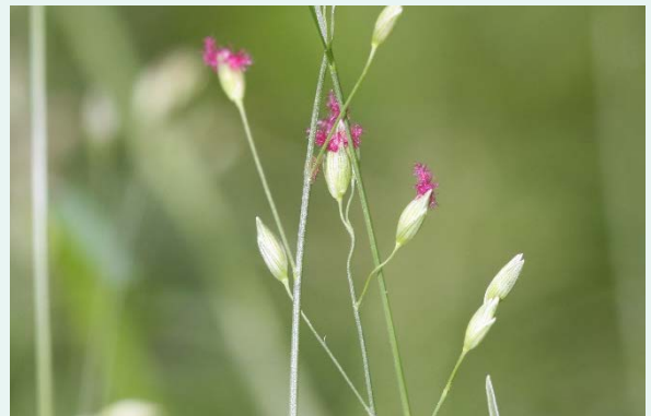
Floyd's grass; the only larval food for the black grass-dart butterfly.

Saving our Species is a NSW Government flagship program delivered by the Environment, Energy and Science Group in the Department of Planning, Industry and Environment. To find out more about threatened species in New South Wales and the Saving our Species program, visit the Saving our Species Program webpage .