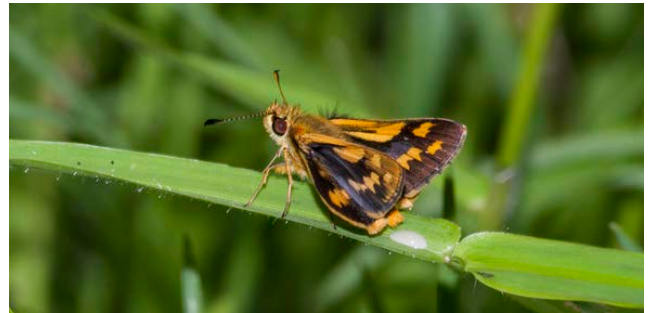
The black grass-dart butterfly.

Next steps for the project include continuing weed control across sites, as the low-lying riparian habitat is susceptible to reinvasion by weeds, and assessments once every five years using full floristic plots to monitor weed densities and Floyd's grass cover and condition.