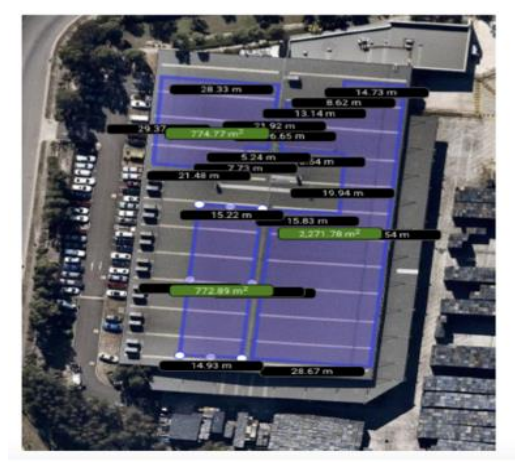
Figure 1: Solar PV concept for the CHEP Erskine Park site

As part of its commitment to address the United Nations Sustainable Development Goals, Brambles set a goal to reduce emissions intensity across all operations by 20% below 2015 levels, by 2020. CHEP's clean energy strategy aligns with this goal.