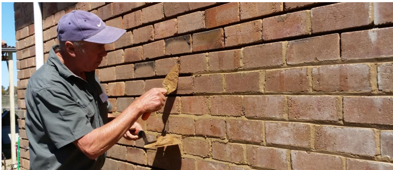
Figure 1 Brick pointing workshop.

This document contains steps for using the fast track approval pathway and a non-exhaustive list of example activities/works which may be eligible for fast track approval. Each example includes standards that apply to those activities/works. Fast track applications are subject to assessment and approval by the Heritage Council (or its delegate). Approvals may be subject to conditions of consent.