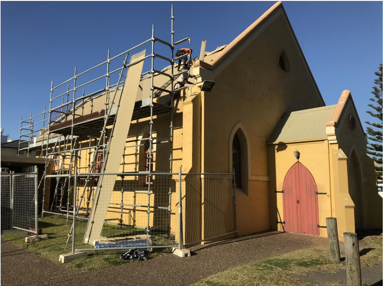
Kiama Uniting Church Lecture Hall