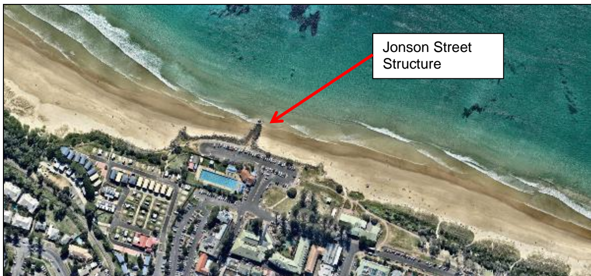
Jonson Street Structure: Source: Nearmap ©

During the 1960’s and 1970’s, Byron Shire Council (“the Council”) constructed an artificial headland protected by a rock seawall adjacent to the car park generally at the northern end of Jonson Street, Byron Bay (“the Jonson Street structure”), as shown on the aerial photo below. This structure extended more than 90m seaward of the dune escarpment.