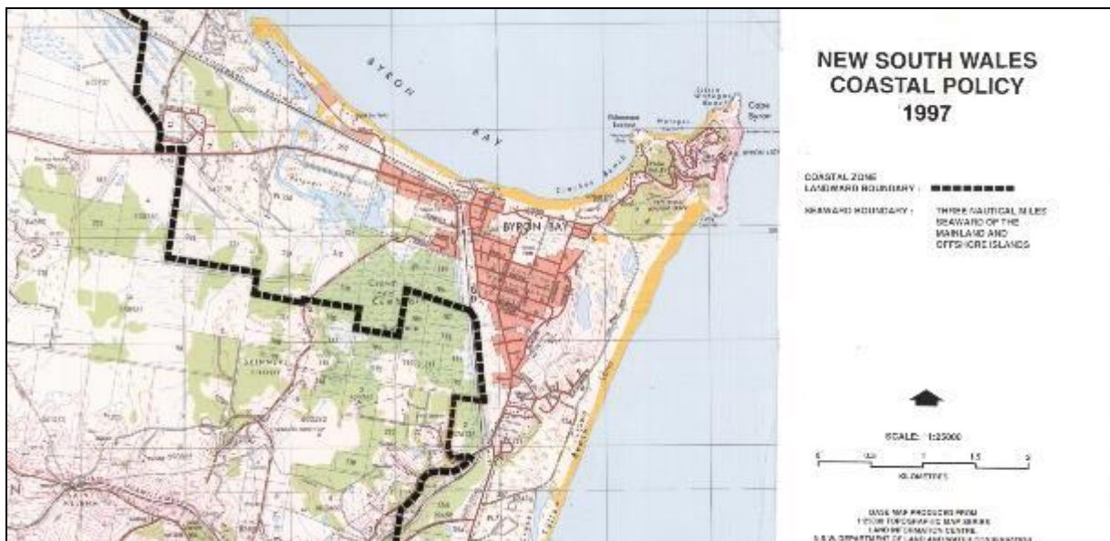
Coastal Zone Map

The land to which this SEE relates is shown on the maps outlining the coastal zone, as outlined overleaf:-