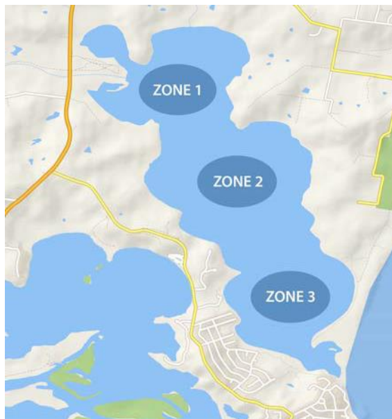
Figure 1: Coastal lake or lagoon sampling strategy

If feasible, rivers are sampled using a longitudinal transect from the mid section to the upper section (Figure 2).