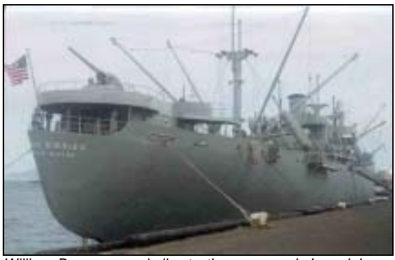
William Dawes was similar to the preserved Jeremiah Obrien at San Francisco.

The William Dawes finally sank at about 4.30 p.m., stern first. Five lives were lost in the action including one US army soldier and four Naval Armed Guards. The next day (23 July), the steamer Allara was torpedoed by another Japanese submarine near Newcastle, but recovered.