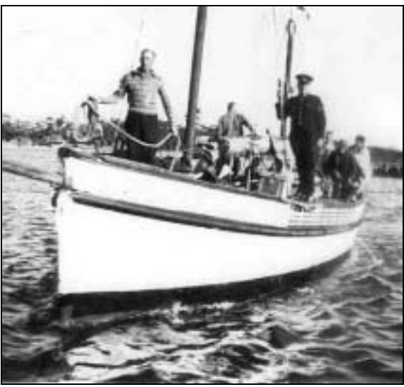
The Lass towing in survivors to Merimbula.

identify the orientation of the hull. Significant features included the remains of a jeep trapped under the hull.