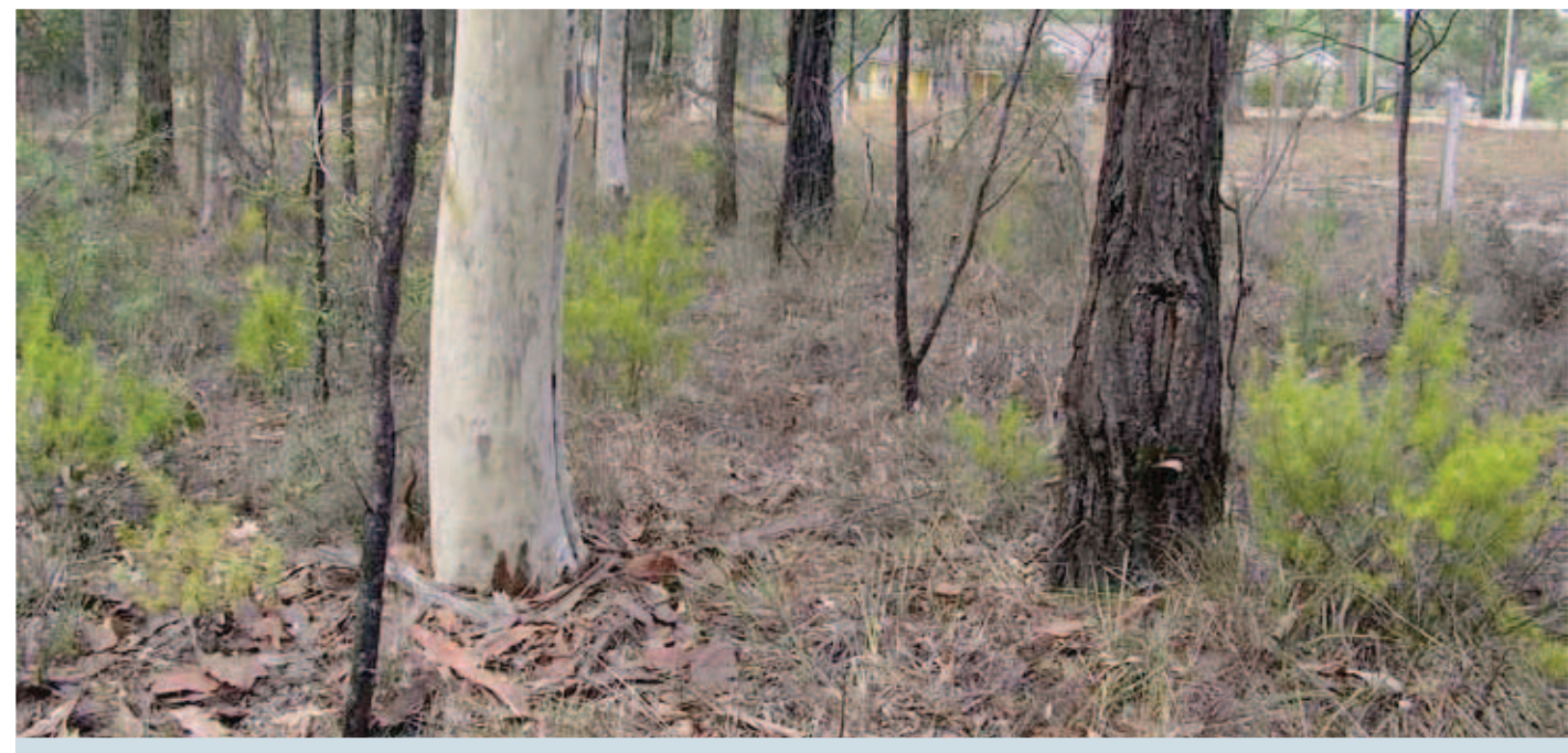
The leaves of North Rothbury Persoonia are often strikingly bright green or lime in comparison to the surrounding vegetation.