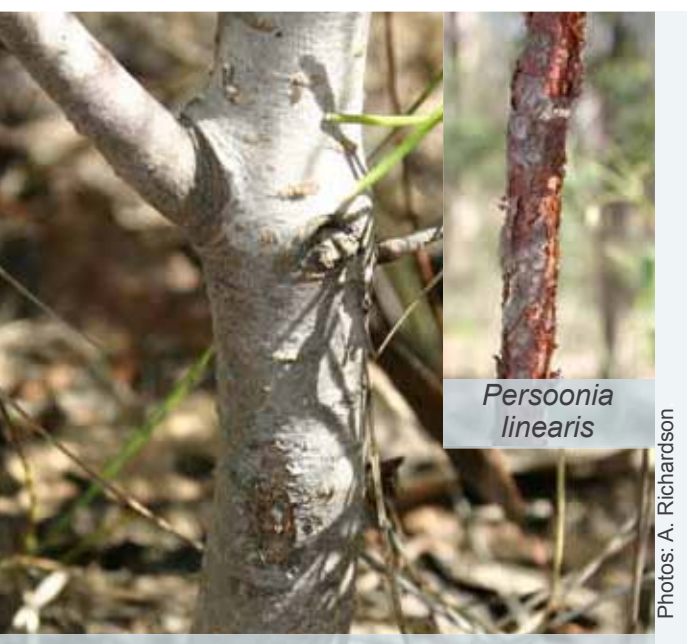
North Rothbury Persoonia bark is smooth and grey