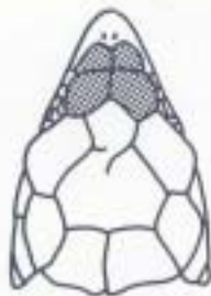
Eretmochelys imbricata (Hawksbill turtle)

2 pair prefrontal scales - thick overlapping carapace scales