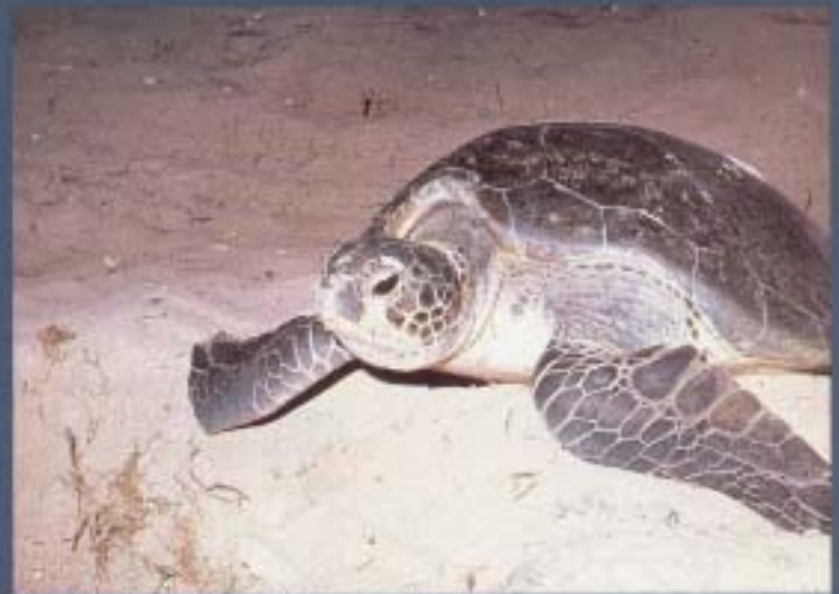
Chelonia mydas (Green turtle)