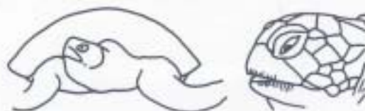
Cheilonia mydas (Green turtle)

- carapace high domed - no preocular scales - colour light to dark green with dark mottling