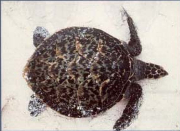
Eretmochelys imbricata (Hawksbill turtle)