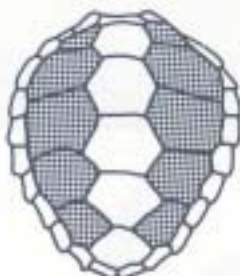
Caretta caretta (Loggerhead turtle)

5 pair (rarely 6) costal scales - carapace longer than wide - colour red-brown to brown - no pores in scales of bridge