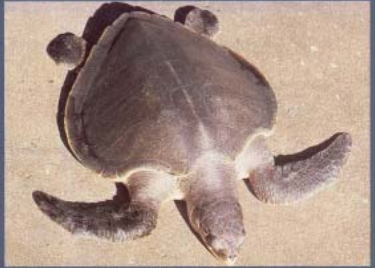
Lepidochelys olivacea (Olive ridley turtle)