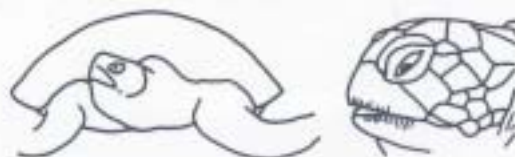
Chelonia mydas (Green turtle)

- carapace high domed - no preocular scales - colour light to dark green with dark mottling