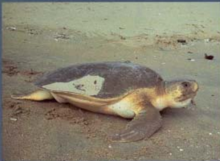
Natator depressus (Flatback turtle)