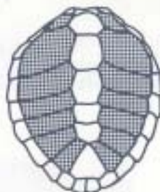
Lepidochelys olivacea (Olive ridley turtle)

6 pair or more costal scales - carapace approximately circular - colour grey green - pores in scales of bridge