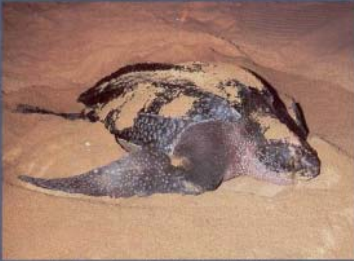
Dermochelys coriacea (Leatherback turtle)