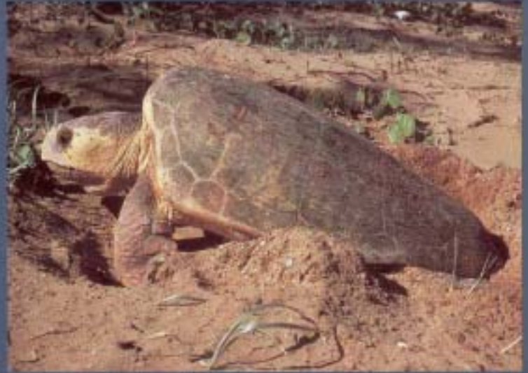
Caretta caretta (Loggerhead turtle)