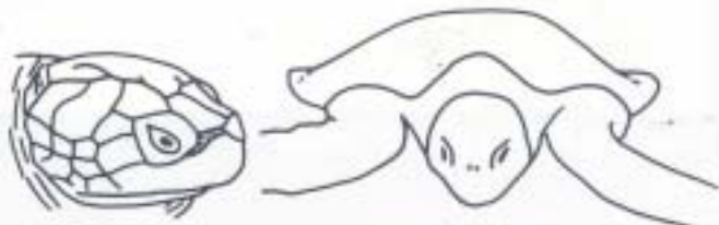
Natator depressus (Flatback turtle)

- carapace low domed with upturned edges - preocular scale - colour olive grey