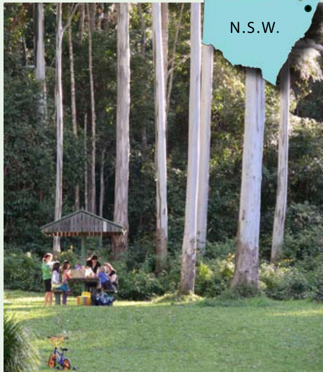
Woolgoolga Creek Picnic Area

Bindarri National Park Bongil Bongil National Park Sherwood Nature Reserve Ulidarra National Park