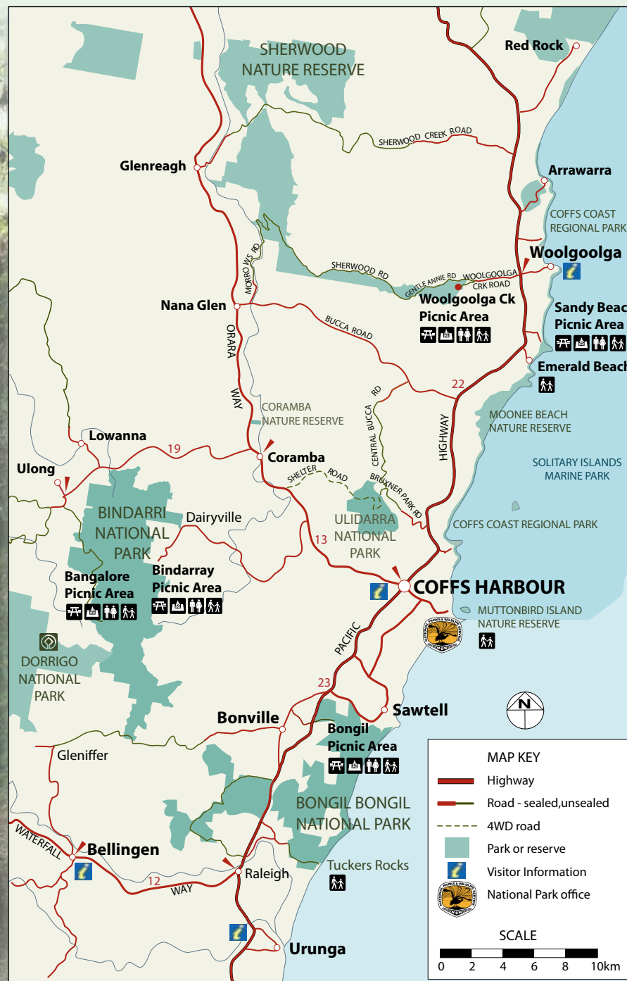
Pine Road, Bindarri National Park

All motorists should be aware that all road rules which apply on public roads also apply within national parks. To operate a car or motorcycle lawfully you must have a valid RTA licence, a roadworthy vehicle, valid motor vehicle registration and appropriate mandatory insurance cover. Vehicles, including motorbikes, are not permitted off formed public roads. Unsealed roads should be used in dry weather only.