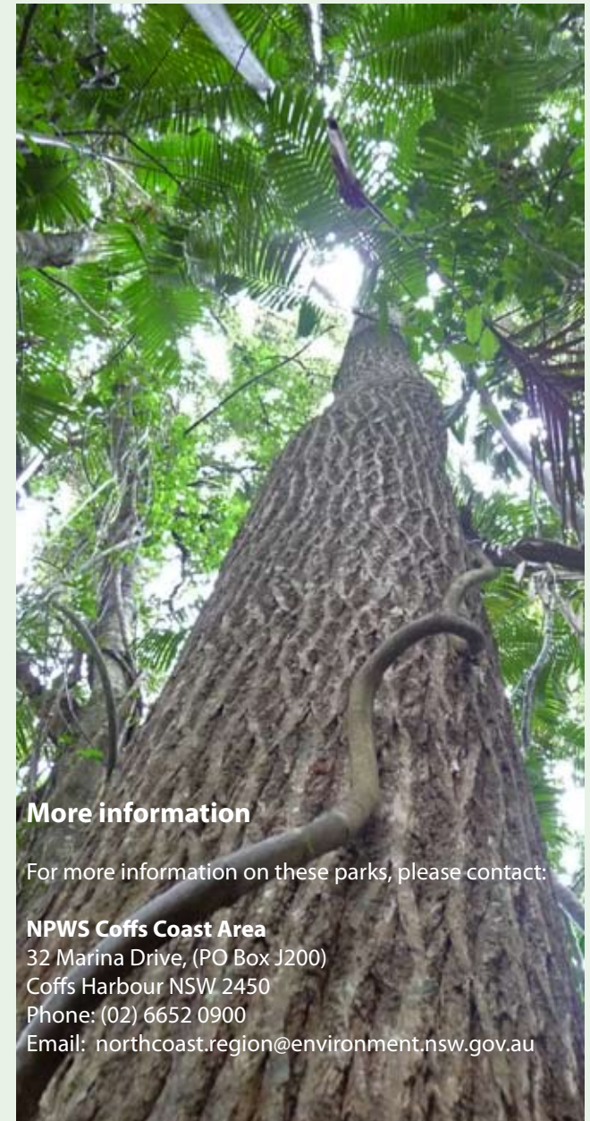
White cedar and vine, Sherwood Nature Reserve