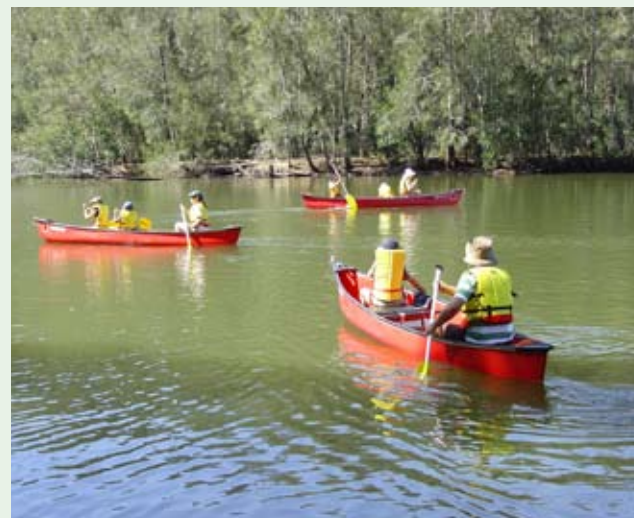
Canoeing on Bonville estuary from Bongil Picnic Area

These parks are located in the traditional lands of the Gumbaynggirr Aboriginal people, and many areas carry cultural significance. Bongil Bongil, Bindarri and Ulidarra are Aboriginal names relating to Aboriginal landscape or mythology. Look for Aboriginal interpretive displays at Woolgoolga Creek Picnic Area in Sherwood Nature Reserve and Bindarri Picnic Area in Bindarri National Park.