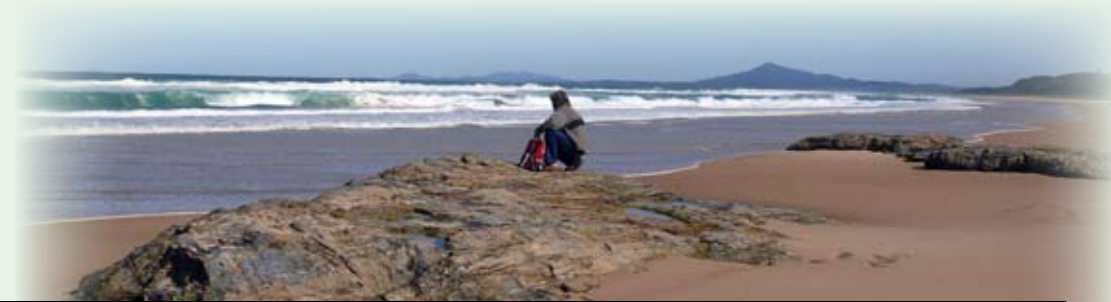
Tuckers Rocks, North Beach

Tuckers Rock Cottage in the park is available for holiday letting through Crown Property Sales on 02 6655 6616.