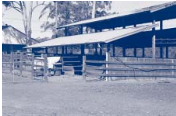
The ground in small yards will often be bare, making erosion and sediment control a significant property management issue.

Ideally, yards should be about 100 square metres in area and have a well-drained surface that resists erosion, such as fine rubble, sand or wood chips.