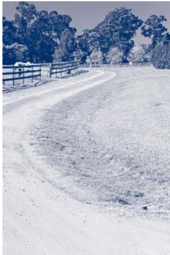
Paths and roads should have a stable surface and be aligned so that they do not become channels for water.