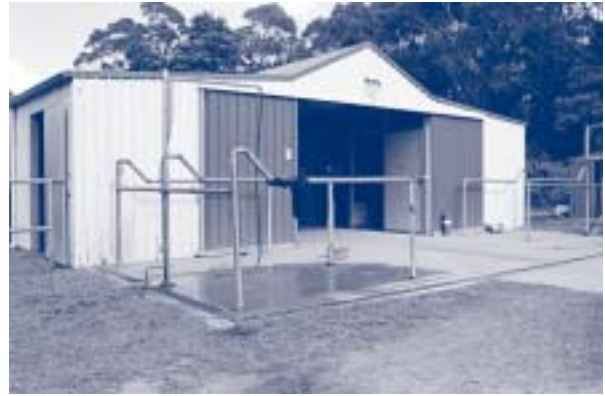
Trapping water from wash-down areas limits the amount of mud generated and allows the water to be re-used on gardens or paddocks.