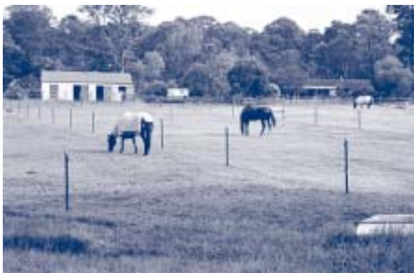
Electric fences provide a very flexible way of controlling where horses graze.

Another strategy commonly used is to remove manure from the paddock for composting and later redistribution on the paddock or use elsewhere. Horses will then be able to safely graze areas of longer grass. If manure removal is impractical or infrequent, spreading manure by harrowing should be practised where possible to help distribute plant nutrients and organic matter, and to avoid patchy pasture growth. Rotational grazing greatly assists the effectiveness of this practice by resting areas for a period after harrowing. This allows pasture to freshen and aids in worm control.