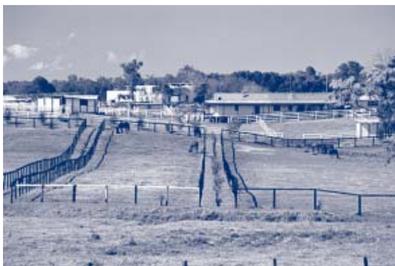
Double fencing such as this stops horses congregating along the fence line which would cause serious erosion on a site like this. It also provides an opportunity to establish a row of trees and shrubs for shelter.

Plant native trees and shrubs to provide habitat for wildlife such as birds and small animals and help stabilize soil.