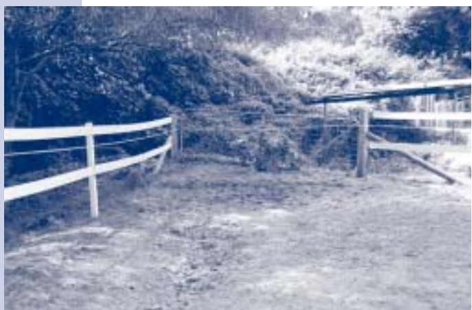
Weeds and grass spreading from a pasture are frequently a sign that nutrients are being washed from the property.