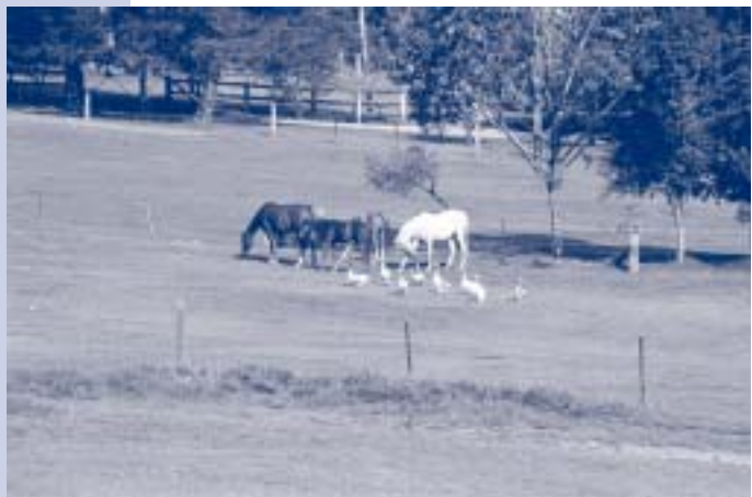
A healthy pasture will be fairly even in height without any patches of bare earth or tall grass and will be largely free from weeds.