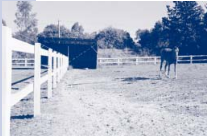
Bare, eroding soil in paddocks is generally a sign of a problem in the way the area is used and managed.

Excess silt in rivers smothers aquatic plants and animal habitats. Native plants help stabilise the banks and provide food and shelter for native fish and animals.