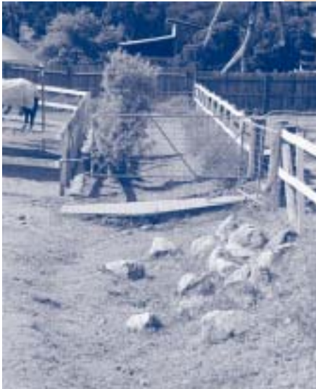
Swales can be used to direct runoff to a dam or sediment trap.