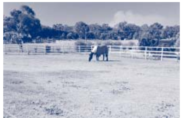
Uneven pasture provides less feed and can lead to soil erosion.

Grazing opportunities should be "rationed" to ensure that even grazing occurs and pasture height is maintained. This strategy will usually require feeding yards, and necessitate the use of electric fencing as an economical means of dividing the available paddock area into uniform grazing blocks. Such an approach can overcome selective grazing ("lawns and roughs") by minimising pasture availability at any one time. This strategy will also assist in managing parasites such as worms.