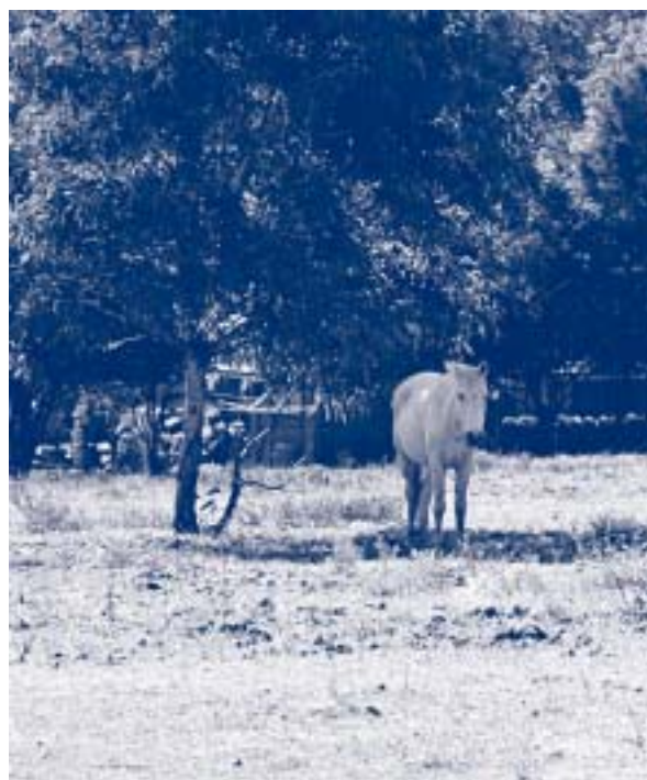
Horse paddocks should provide horses with sufficient protection against sun.

Horse paddocks should provide horses with sufficient protection against sun, wind, rain and extremes of temperature. Shade trees, roofing and windbreaks may be necessary. Horses will tend to congregate in these shady areas and create bare patches so plan to have them away from drainage lines. Rows of native plants between paddocks protected by double fencing make effective shelter.