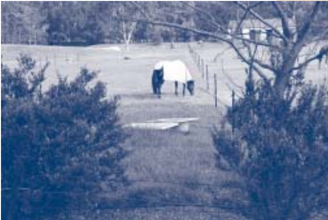
With a water trough in the paddock, horses can be kept from trampling stream banks.

A well laid out property will be easier to look after and avoids damaging the surrounding environment.