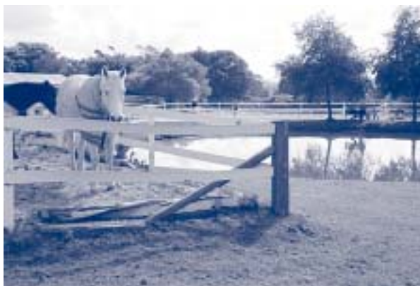
This yard has a low silt fence to limit erosion and the small dam will catch runoff before it leaves the property.