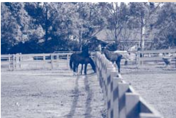
The area around gates where horses, vehicles and people enter and leave a paddock tends to become worn as the soil is compacted.

■ If you need to store chemicals such as herbicides or fuels on the property, are they secure? What would happen if there were spills? Think about where liquids would flow if not stopped. Have some absorbent material available such as sawdust to soak up any spills. Ask your council about ways to manage these storage areas.