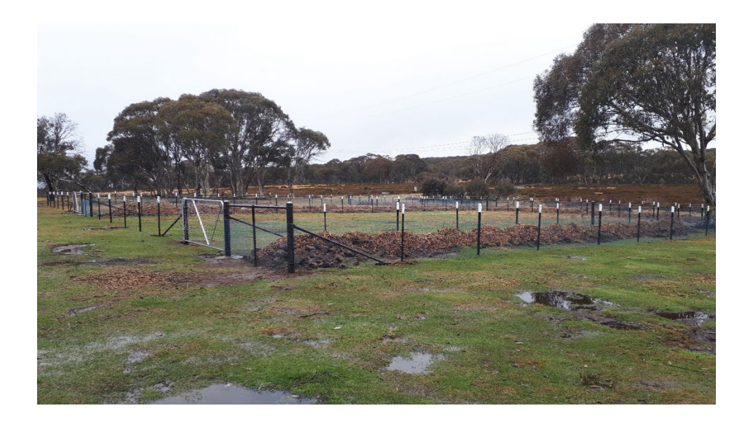
Figure 1 New horse yards at Bullocks Hill campground funded under the Kosciuszko Offset Project.