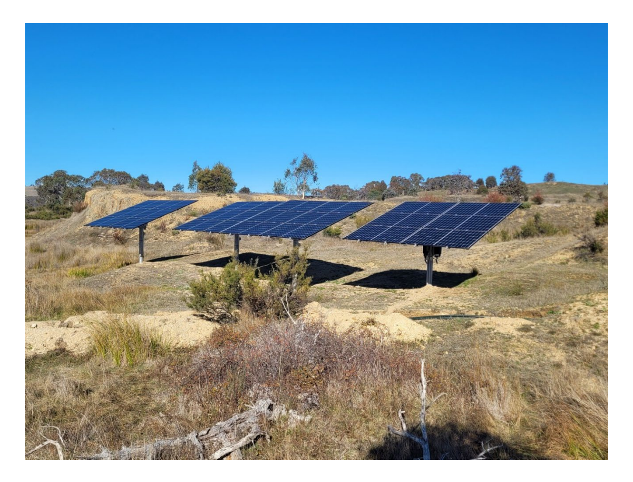
Figure 4 Solar panels providing energy to water pumps for stocky galaxias ponds for species protection and restocking. The water pumps were funded under the Kosciuszko Offset Project.