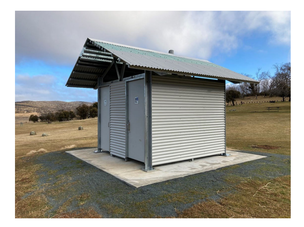
Figure 3 New toilet block at Denison campground funded under the Kosciuszko Offset Project.