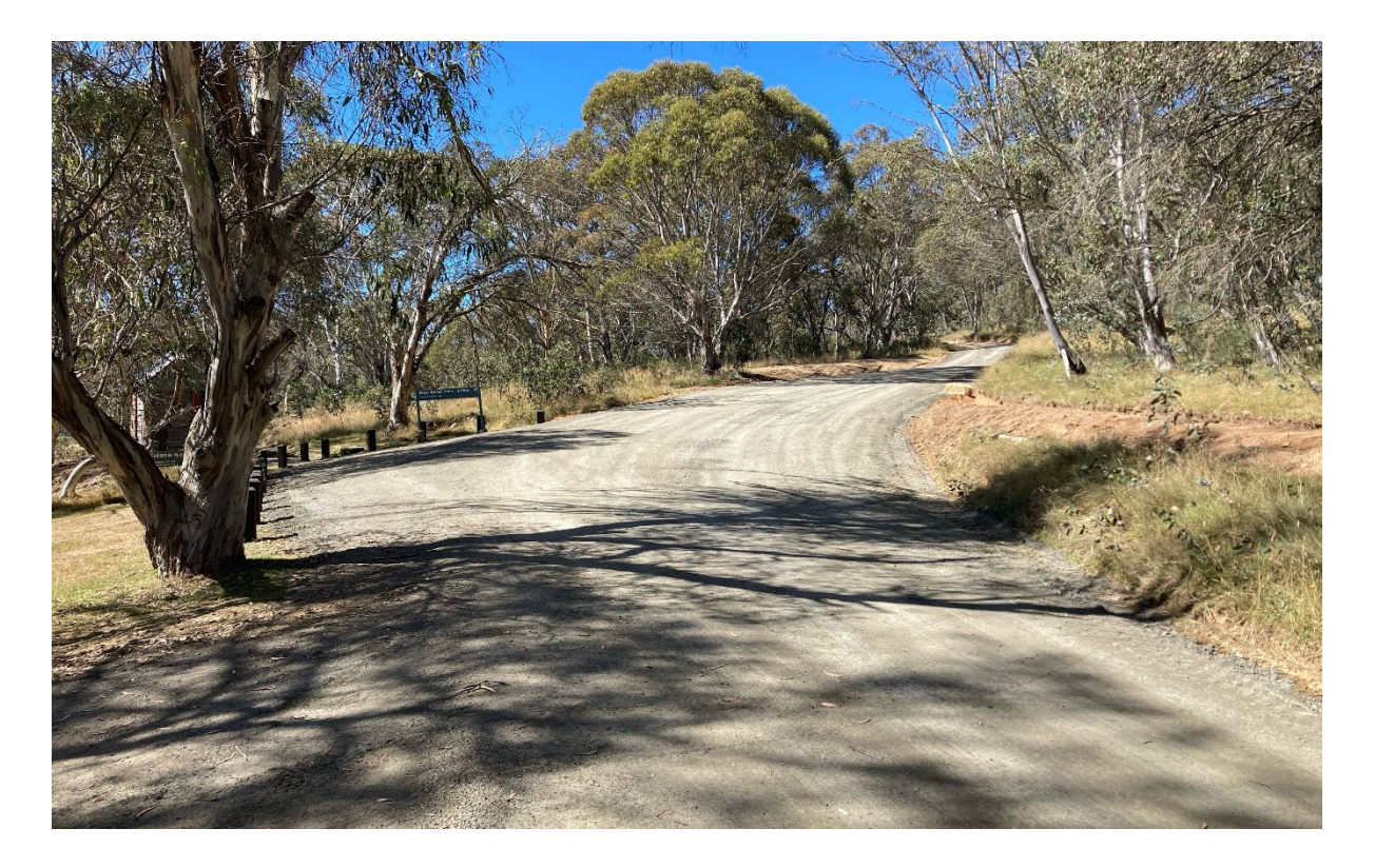
Figure 6 Coolamine Homestead car park extension, funded under the Kosciuszko Offset Project.