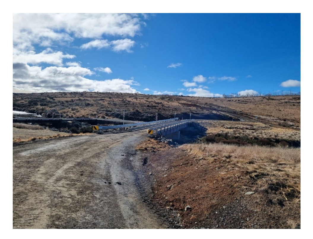
Figure 2 Port Phillip Trail bridge replacement and road realignment. Funding contribution under the Kosciuszko Offset Project.