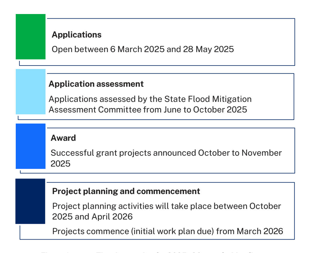
Figure 1 Timeframes for the 2025–26 round of funding

Figure 1 outlines the key timeframes for the 2025–26 round of funding applications.