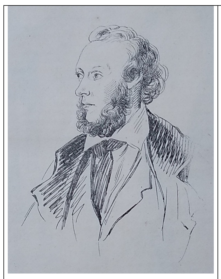
Figure 1: Benjamin Boyd 1847