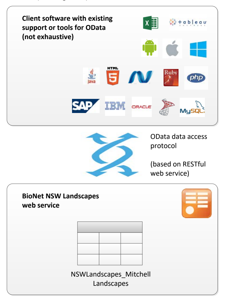
Figure 2 Conceptual overview of data exposure via the OData-based BioNet NSW Landscapes Web Service

OData makes data available via entity sets. These can be thought of as tables of data – like a sheet within a spreadsheet. One entity set is available for the NSW Landscapes Web Service (see Figure 2).