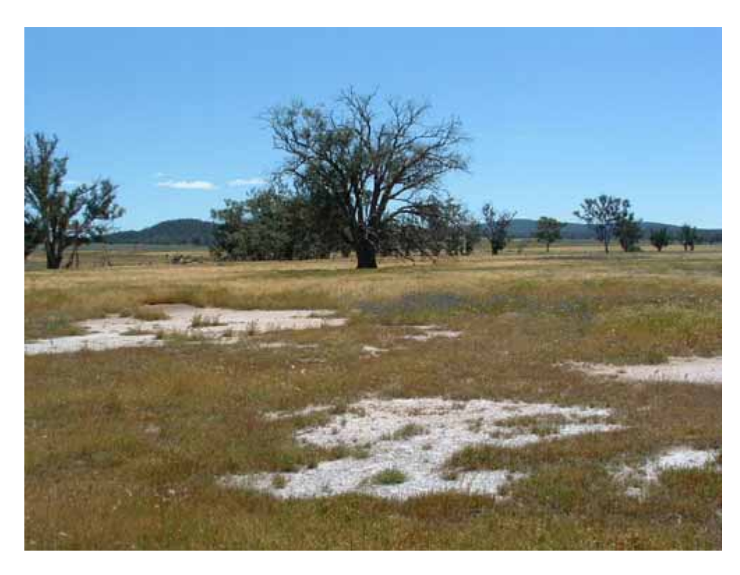
Plate 3: Class 3 site north of Eugowra showing tree decline, scalding, sheet erosion and salt encrustation.

Regeneration of these sites is more difficult and may require some cultivation of the top few centimetres to dilute the salt at the surface. An application of mulch will also provide a less severe environment for germination.