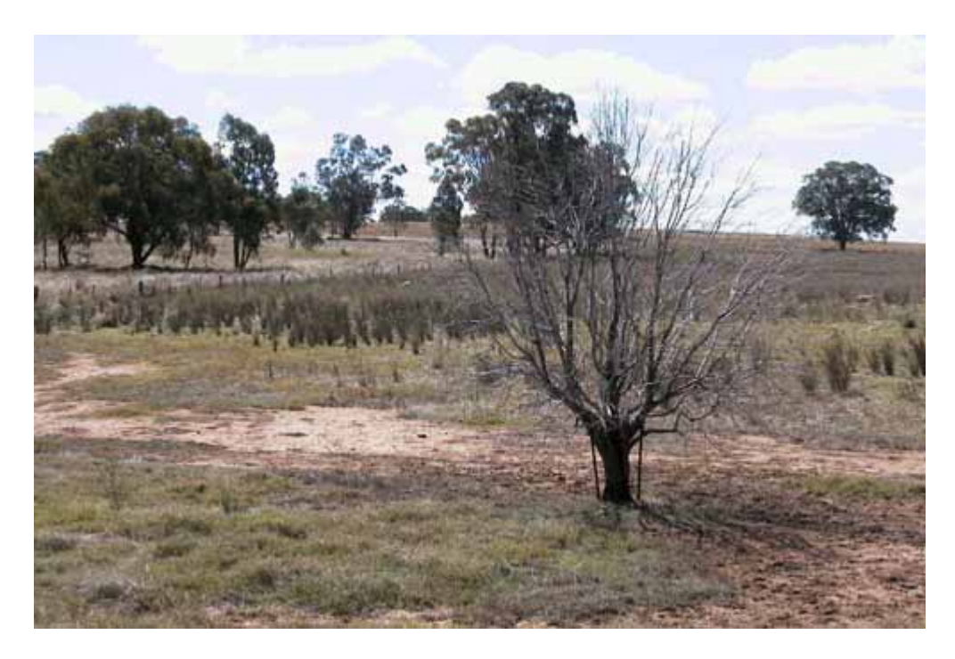
Plate 2: Class 2 site showing vegetation zoning (spiny rush, couch then sea barley grass), vegetation death and small bare areas.

Class 2 sites have salts concentrated in the root zone and at the soil surface. These sites are suited to highly salt tolerant grasses and shrubs and there is generally a dramatic change in species composition to highly salt tolerant species and the appearance of small, bare areas.