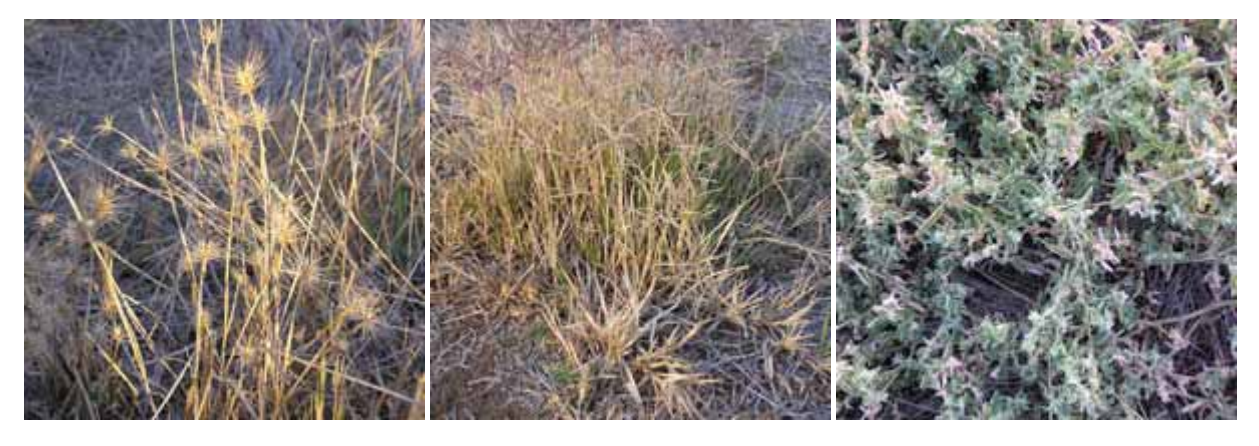
Figure 1: Common salt tolerant plants.

Some common salt tolerant plants are shown below, however, their presence is not conclusive proof of salinity. The presence of other symptoms such as tree death, canopy thinning, stunted growth and bare soils may indicate the land is saline but this should be confirmed by testing the soil salinity.