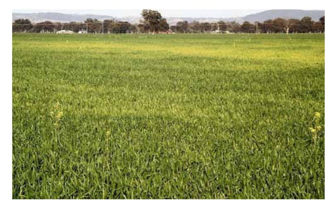
Plate 1: Class 1 site south west of Cowra showing yellowing of a cereal crop due to water logging & salinity.

Class 1: Slightly Saline (2-4 dS/m EC _{e} ) - Class 1 sites show earliest visible signs of salting and occur where the watertable has started to move salts into the root zone. They have a surface soil electrical conductivity (EC _{e} ) of 2 - 4 deciSiemens per metre.