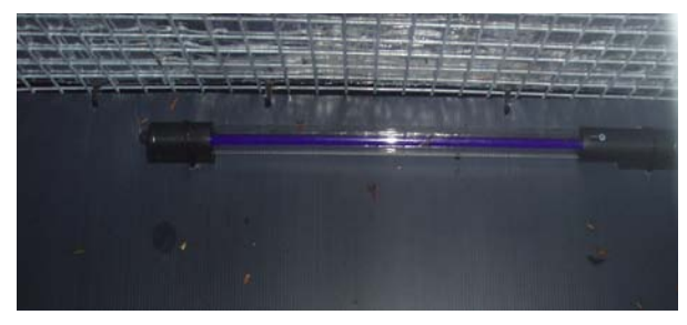
UV black lights available from electronics outlets

When the lights are on they attract insects, the insects in turn attract the toads. The toads push on the one way finger gates to enter the trap to feed on the insects and become captured. During their stay in the trap they feed at their own will at night and seek shelter and water from the trough during the day.