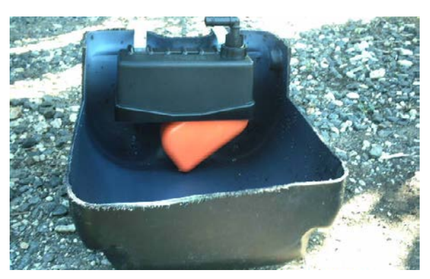
Trough and float valve supply water to captured toads