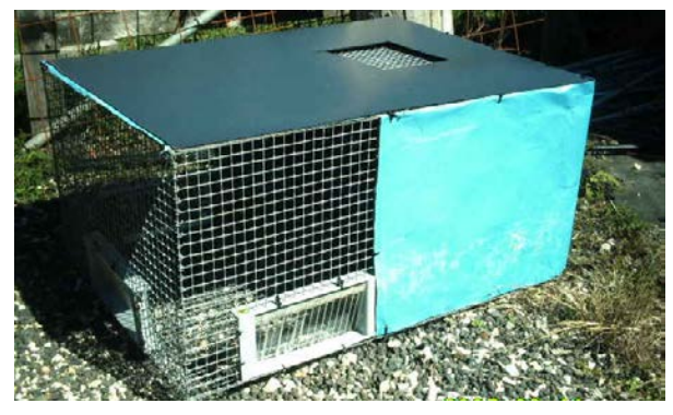
An example of a Super trap

When set up with adequate water and all parts functioning correctly, the Super Trap can house captured toads humanely for an extended period of time.