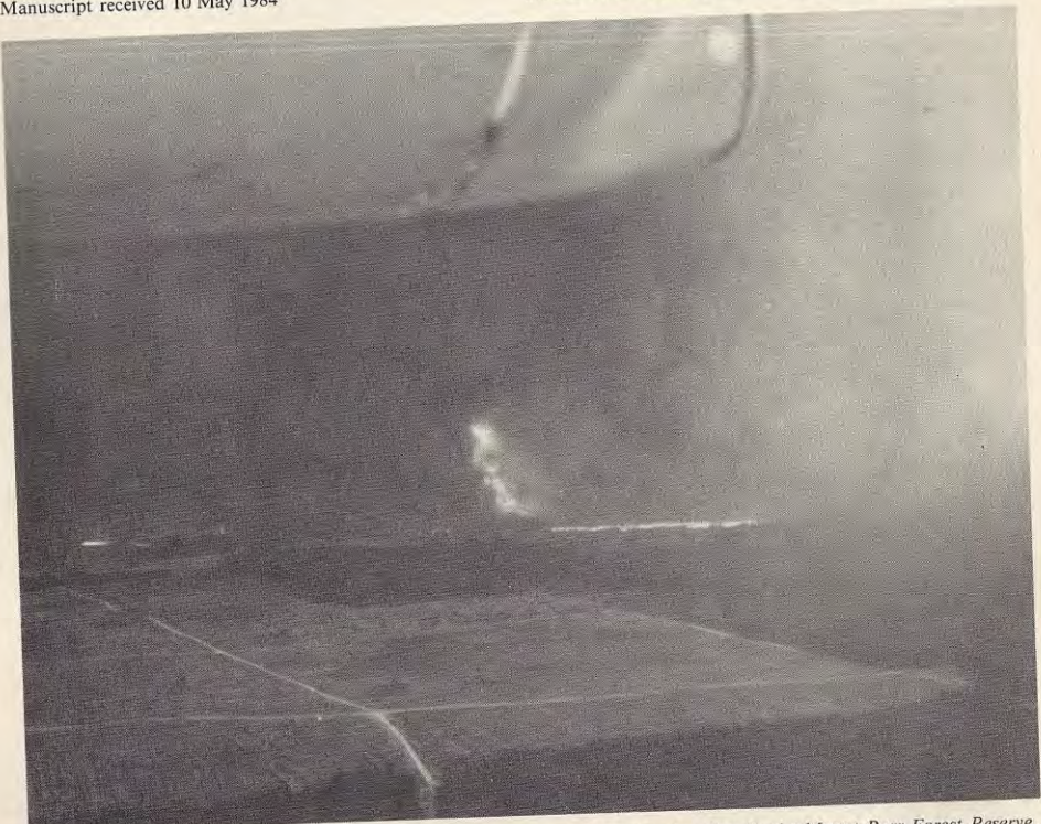
Column of flame, almost 200 m high, generated by one of the Ash Wednesday fires in the Mount Burr Forest Reserve, photographed from the air, under conditions of poor visibility, at a height of 1200 feet and distance 4 km.

By the time the accompanying photograph was taken, at approximately 1445 hours, the fires had entered the northern end of the Mount Burr Forest Reserve. At this time, the aircraft was situated about 17 km north of Millicent and 4 km south south east of Furner (see Figure 2, Keeves