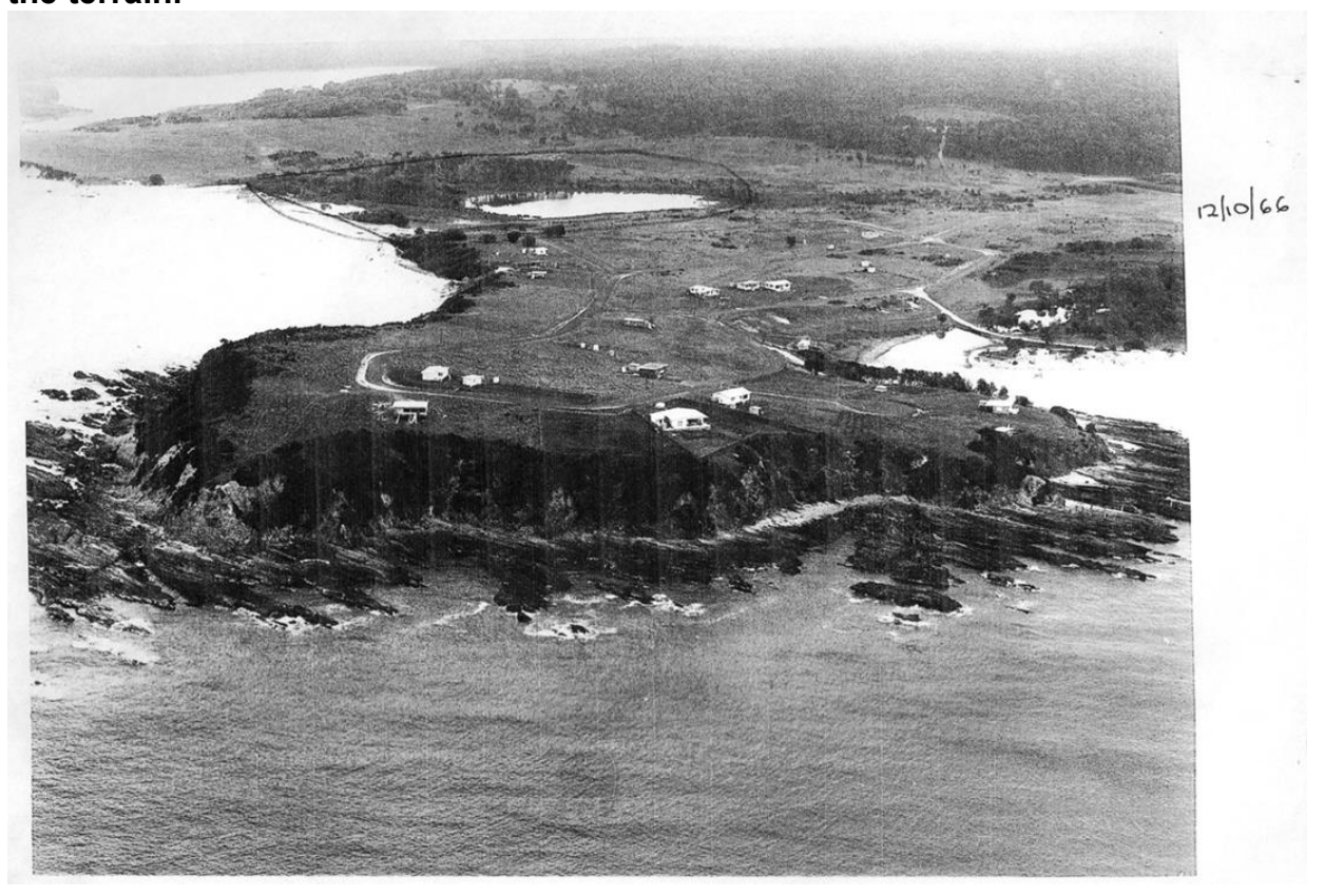
Potato Point and its Surrounds in 1966

First, the bulk of the documentation ignores the fact that all of the study area and substantial areas beyond comprised grassland grazing paddocks for over 100 years. Indeed, there is evidence that even before white settlement this stretch of coast was frequently burned by the local Aboriginal communities. It is only in the last 30 years that regrowth forest has been permitted to dominate the terrain.