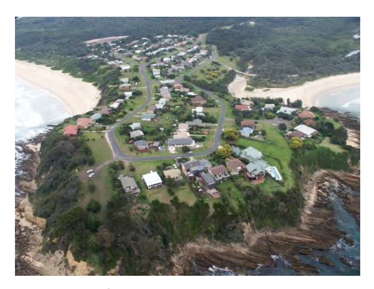
Potato Point and its Surrounds in 2004

Despite this, much of the discussion in both the Species Impact Statement and the Review of Environmental Factors invites the reader to take seriously the proposition that this limited area of regrowth, that abuts vast areas of old-growth forest, could somehow be critical to the future of several flora and fauna species. This defies common sense and is reinforced by the very low numbers of significant species that the researchers detected in the area.