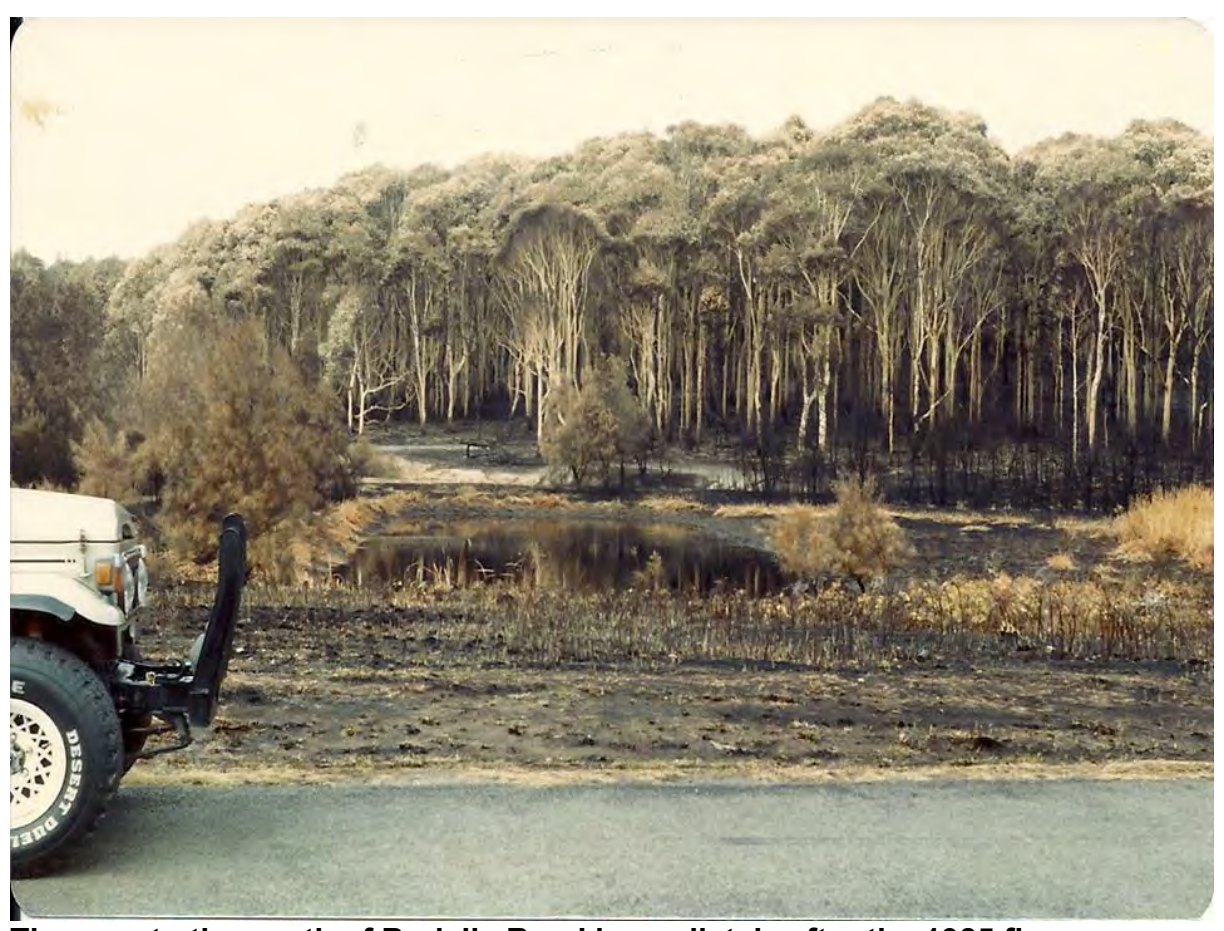
The area to the south of Bodalla Road immediately after the 1985 fire.