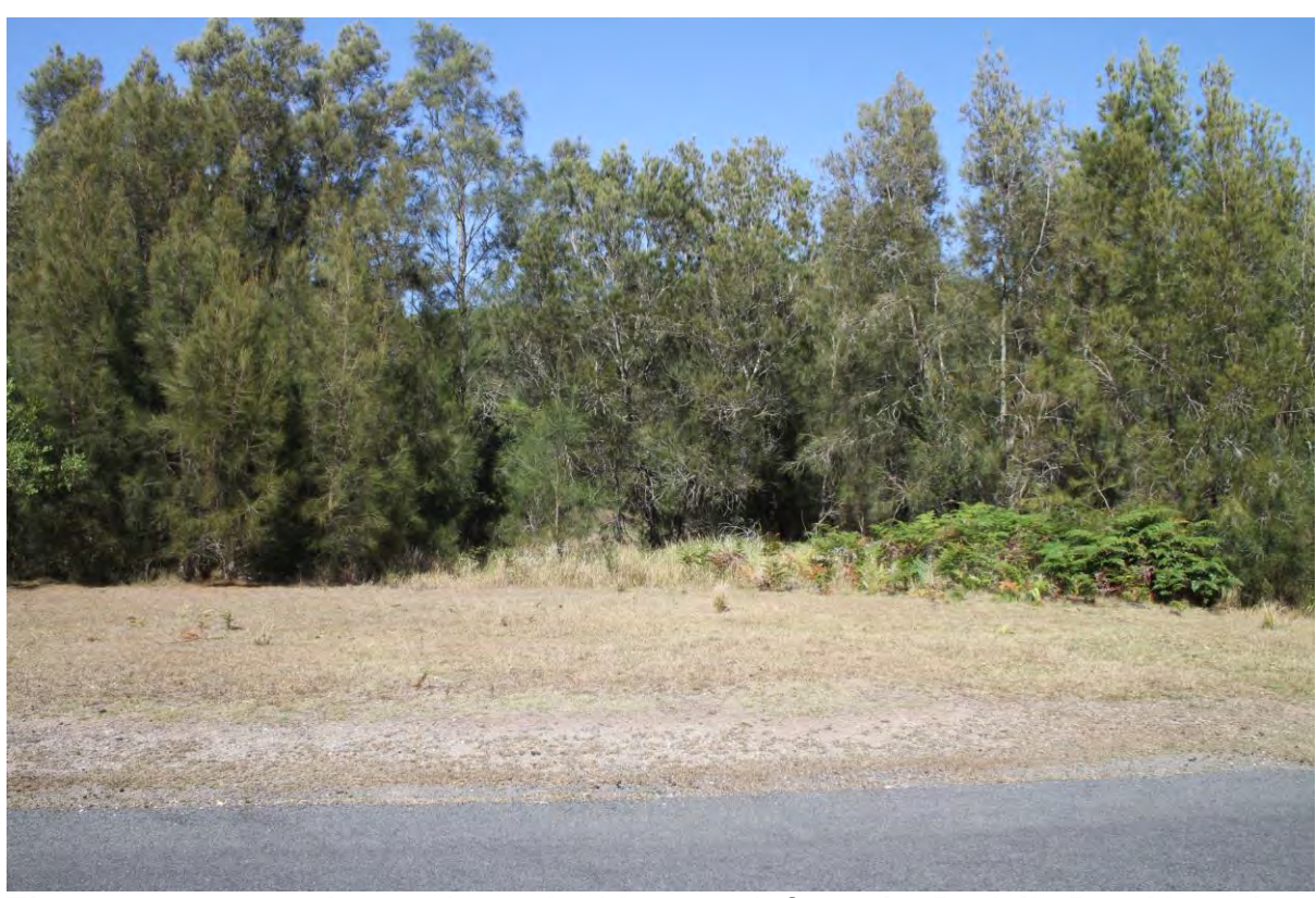
The same area as shown above, looking south from the Bodalla Road in 2014.