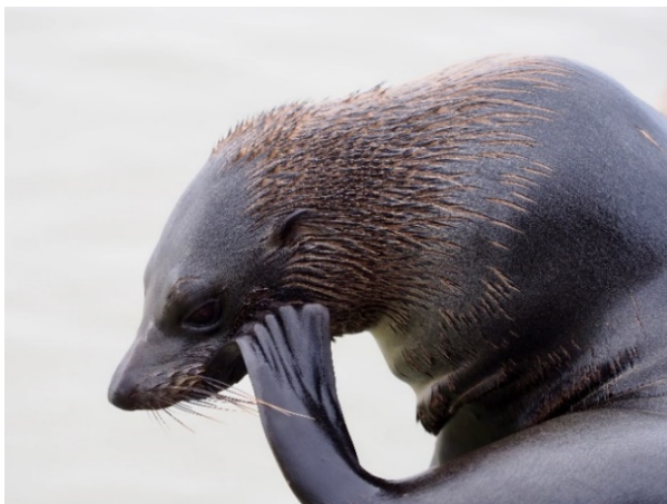
Figure 19 New Zealand fur seal grooming

Seals spend a lot of their time grooming, using their flippers to scratch, particularly around the face, neck and shoulders (Figure 19). Fur seals use the claws on their rear flippers, while true seals will use claws on their front flippers. Often after a seal has been scratching, there will be lines of separated fur exposing the undercoat. To the untrained eye this might look like an injury or even an entanglement, but it is normal seal behaviour.