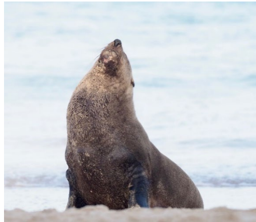
Figure 18 Signs a seal is alert

Both photos show seals that are alert and on guard checking for threats. The seal on the left has just returned from the water and the seal on the right is moving position after resting in the same spot.