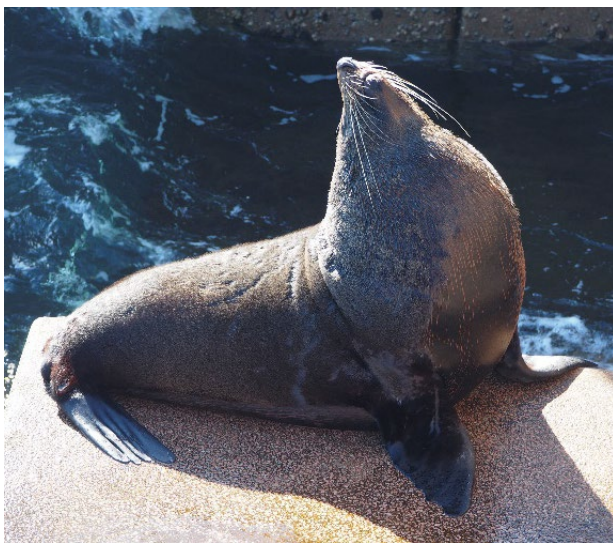
Figure 16 New Zealand fur seal with signs of moulting

Fur seals can moult at any time throughout the year, and the condition of their pelage will be determined by what stage they are at. At times their fur can be thin in places and a bit tatty looking (Figure 16). Again, this is a normal process and not a cause for concern, but should be included in the evaluation.