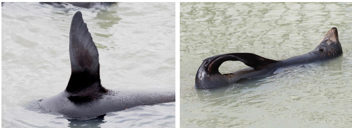
Figure 17 New Zealand fur seal thermoregulating

True seals, particularly elephant seals, are also observed flicking either sand (sand flipping) or even small pebbles over their back to keep cool.