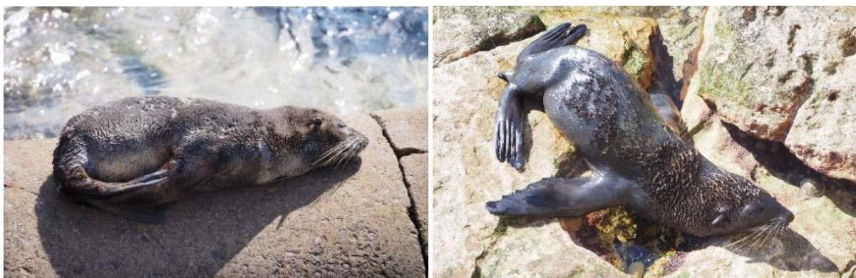
Figure 6 Importance of body position when assessing body condition

Many seals like to rest curled up with their rear flippers tucked below their belly. This can distort the body condition, particularly when the fur is dry, and the seal will look bigger and fatter. It is best to ensure the seal is stretched out and if possible, assess and take photos when the seal has just hauled out from the water and its fur is wet (Figure 6).