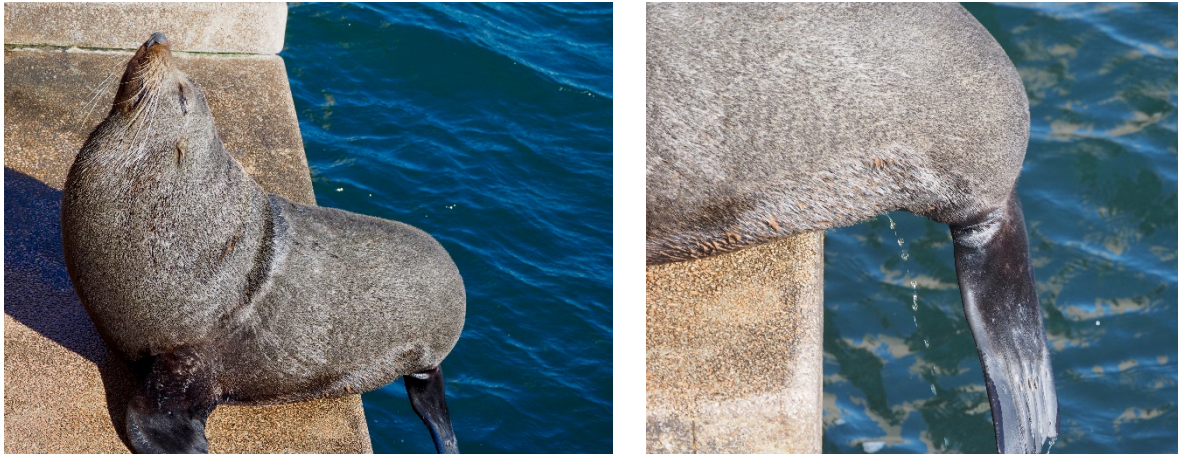
Figure 20 New Zealand fur seal urinating

Hauled out seals should be monitored for faecal output and signs of urination (Figure 20). A description, and if possible a photograph should be taken, but only when it is safe to do so. This is best achieved with a telephoto lens or after the seal has left the area. Scats from true seals may be of scientific significance and provide valuable information on the seal's diet and health. They should be reported to NPWS if observed.