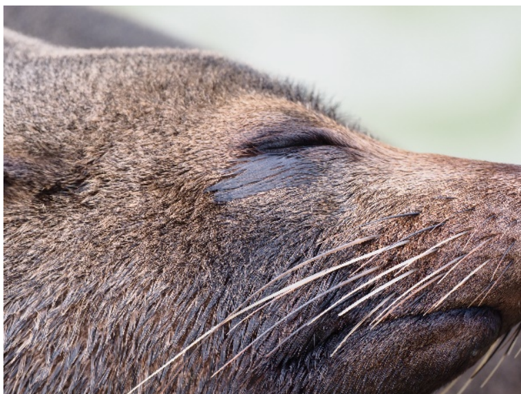
Figure 13 Eye discharge

Elephant seals have large and prominent eyes and they are often also red rimmed. In these cases, the reddening of the conjunctiva is normal and not an indication of an eye injury. As seals move between water and hauling out on land it is normal for them to secrete tears to lubricate their eyes, which shows up as a dark patch. This eye secretion is clear (Figure 13). When assessing eye discharge, only be concerned if the eye secretion is coloured or asymmetrical (i.e. not even on both eyes).