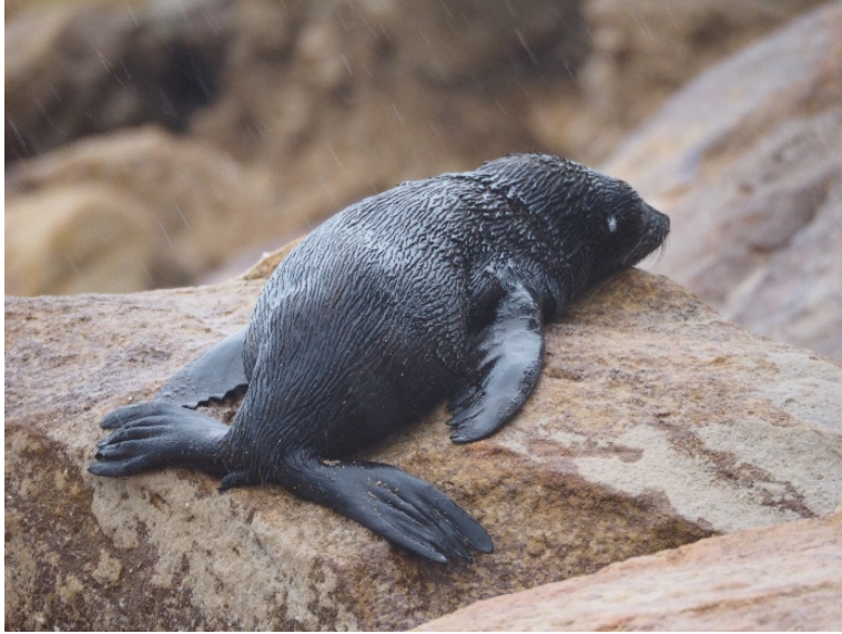
Figure 3 Juvenile New Zealand fur seal