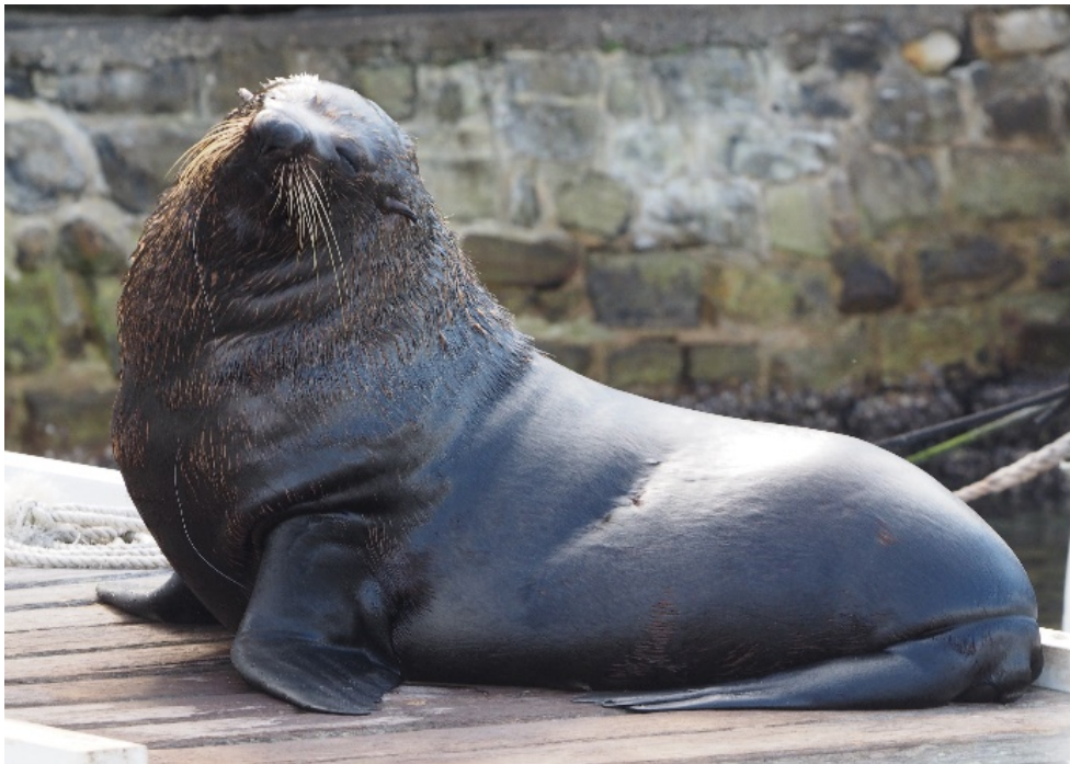
Figure 11 Evaluating an entanglement

Every seal needs to be closely observed to look for evidence of entanglements. While heavy marine debris such as ropes and nets are easily seen, some entanglements such as fishing line are not very obvious at first glance (Figure 11). Each entanglement needs to be recorded with details on the type of materials and their location on the seal. While some fishing equipment such as hooks and sinkers may fall off naturally, other entanglements will require intervention. The process is incredibly stressful and having a plan in place before commencing will minimise the stress on the animal. This means the information and photographs provided to NPWS staff tasked with carrying out the disentanglement process are crucial.