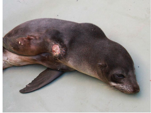
Figure 9 Healing cookiecutter shark bite