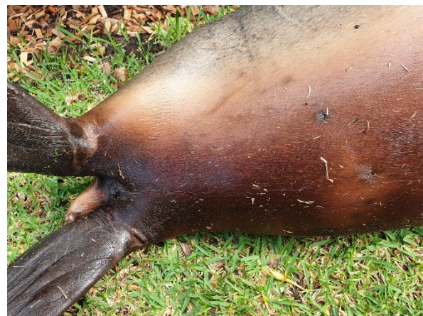
Figure 4 Identifying the sex on a seal

A photo showing the whole belly area will assist with sex identification. In the left photo both the testes and penile opening are present, indicating a male fur seal. The right photo shows a female Australian sea lion.