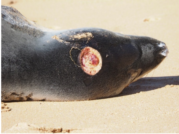
Figure 8 Fresh cookiecutter shark bite