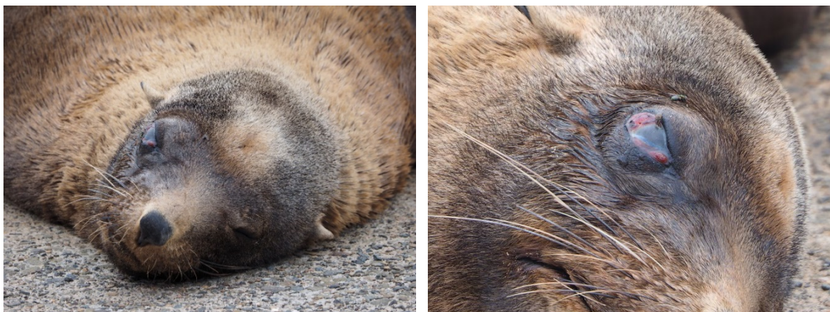
Figure 12 Evaluating eye injuries

Eyes should be carefully assessed for signs of infectious disease or trauma. These may be indicated by swelling of the eye or the surrounding tissue, reddening of the conjunctiva (inside of the eyelids) or cloudiness of the eye itself (Figure 12).