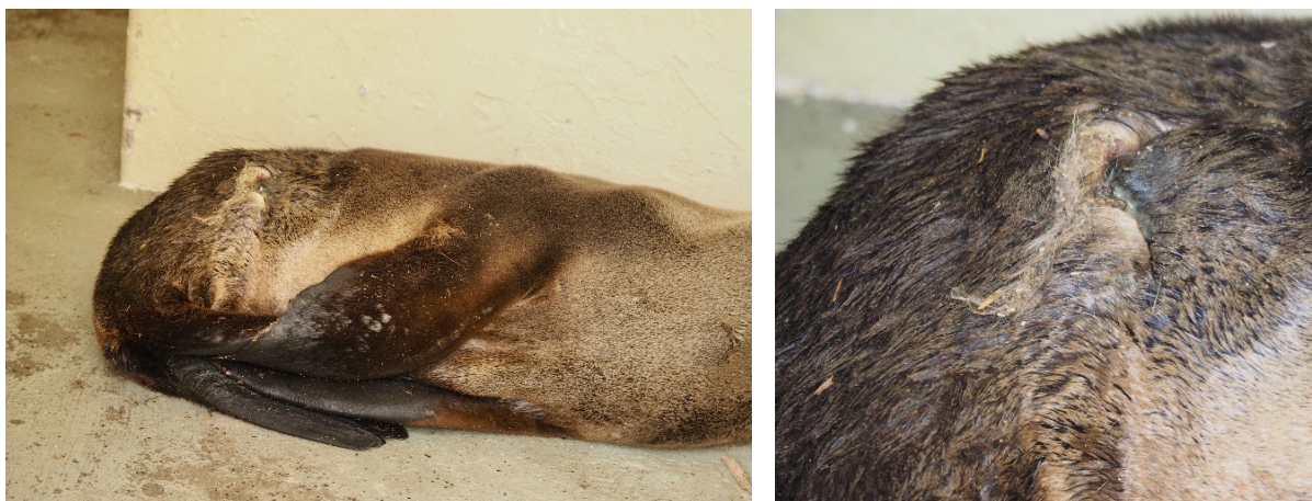
Figure 7 Assessing wound condition

For each wound, identify how recent it is and if there are signs of healing or infection. Recent wounds will have a red or pink appearance and as the wound heals, a yellow fibrinous layer will form around and over the wound and it will start to decrease in size. Signs of infection include a coloured discharge (pus), or the wound is swollen and very red (Figure 7).