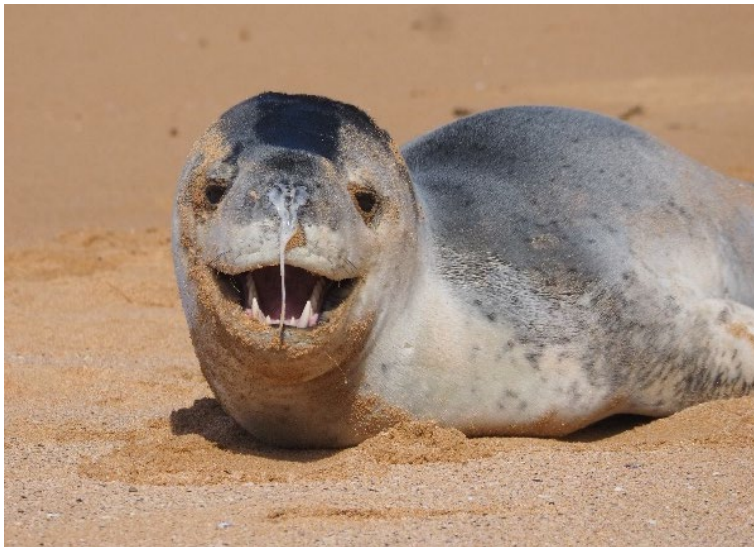
Figure 14 Clear nasal discharge on a leopard seal

Wildlife rehabilitators must observe the condition of a seal's nose for signs of upper respiratory disease (nasal discharge). It is important to note that phocids (known as true seals) such as the leopard seal, elephant seal and crabeater seal regularly have a clear nasal discharge. This is normal and not a sign of infection (Figure 14). For these species, wildlife rehabilitators need to note if a coloured nasal discharge is present and if in any doubt, NPWS will refer the evaluation to a marine wildlife veterinarian for assessment from the photos and description in the evaluation report.