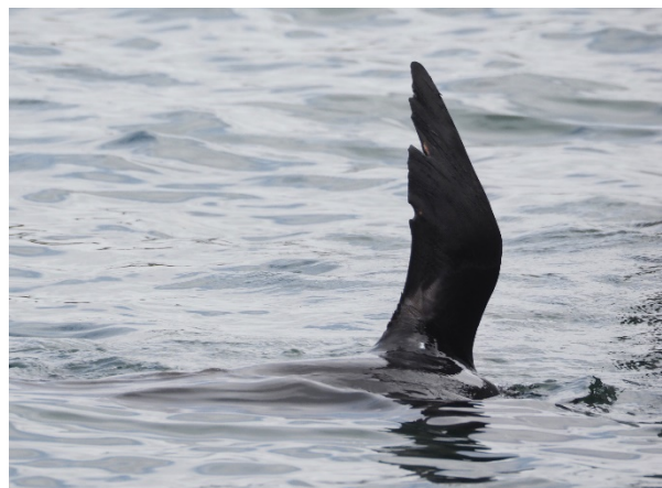
Figure 10 Individual seal identification from injuries and bites

The New Zealand fur seals in both photos have circular bites and nicks on the trailing edge of their front flippers. These can be used to identify the seal individually when the seal moves to new locations.