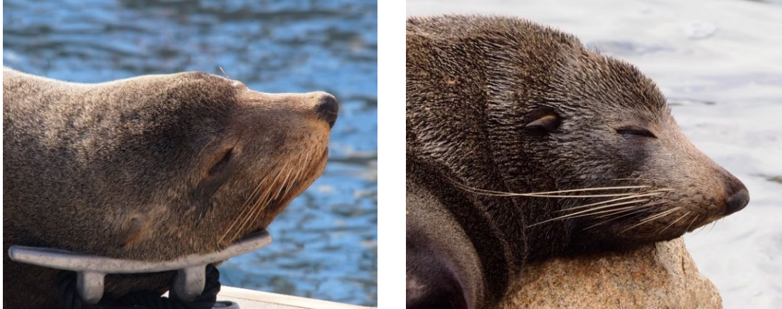
Figure 1 Comparison of side profiles of the snout

New Zealand fur seals are also known as long-nosed fur seals, which reflects their distinctive long and pointy snout and long whiskers (vibrissae). At least 3 whiskers are much longer than the rest and can reach past the external ear flaps. The Australian fur seal has a much stockier snout with shorter, more even whisker length (Figure 1).