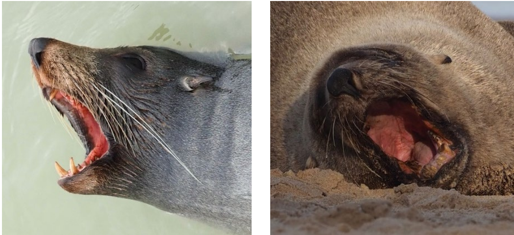
Figure 15 Tooth wear and gum colour

Note the normal pink gum colour for both seals. A comparison of tooth wear shows that the first photo on the left is of a younger New Zealand fur seal with long white canines. The photo on the right is an old male Australian fur seal with the teeth discoloured and worn almost down to the gumline.