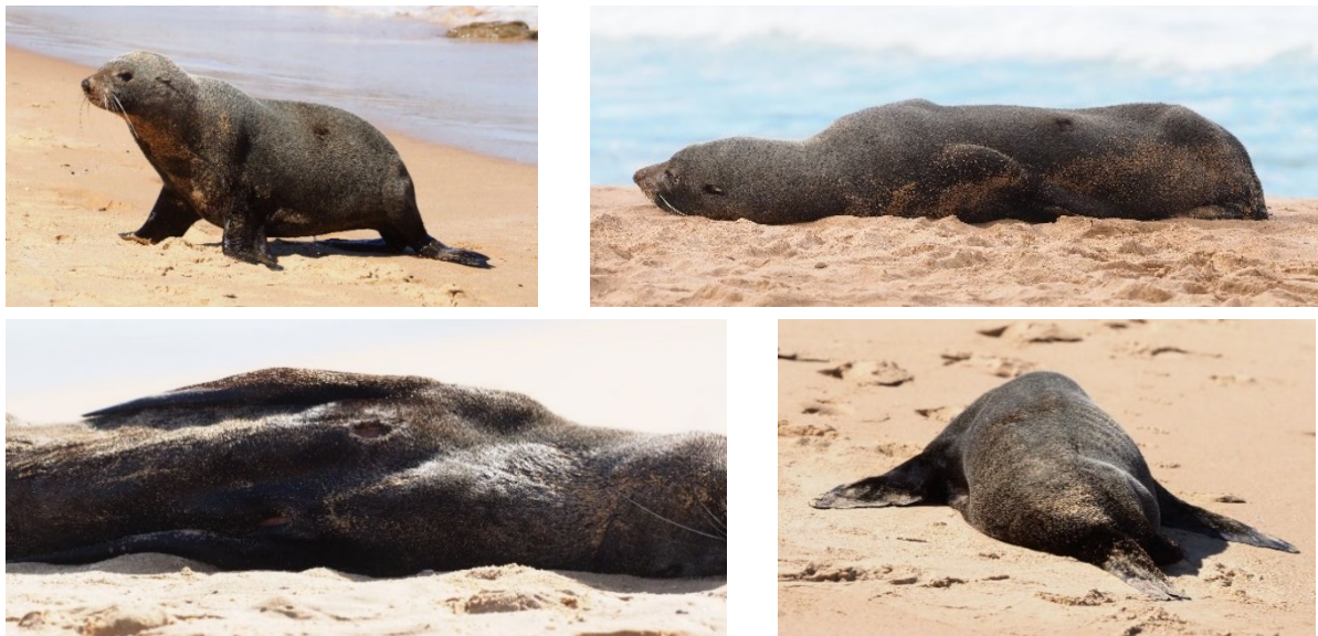
Figure 5 Assessing body condition over time

It is best to evaluate the seal when it is more relaxed, taking photos from different angles and focusing on the neck area and the rump, as these are the first areas to show signs of poor condition (Figure 5).