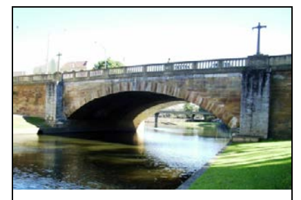
State heritage One of the oldest surviving bridges of colonial NSW, designed by the first colonial Superintendent of Bridges – Lennox Bridge , Parramatta, 1839