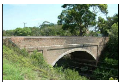
Local heritage A good example of a brick arch bridge associated with the early 20<sup>th</sup> century electrification of the Illawarra rail line – Rail bridge, Thirroul , circa 1920s