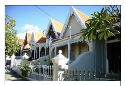
Local heritage Good examples of modest Victorian terraced housing of Paddington, demonstrating the 19<sup>th</sup> century development of Paddington – circa 1890

Use of 'exceptional', 'high', 'moderate', 'little', 'low', 'intrusive' significance or other expressions of degree only relate to grading components of a place, not the overall level of significance of a place. These gradings are described in section 6 of Assessing Heritage Significance .