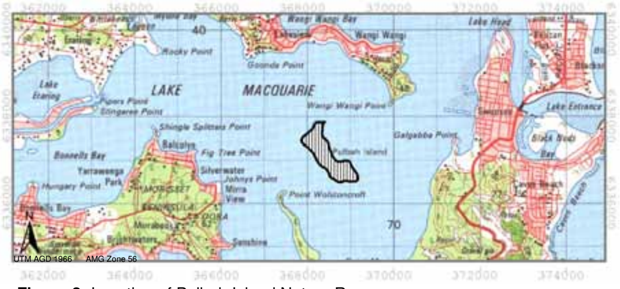
Figure 2: Location of Pulbah Island Nature Reserve

Pulbah Island NR (69 ha) is located nearby Lake Macquarie State Conservation Area, north of Point Wolstoncroft and south east of Wangi Point. The slight rise from the north to the south of the island could provide an uphill run for ignitions, however, the gentle slope has little influence on increased fire behaviour potential. Being surrounded by Lake Macquarie, there is little encouragement for fires to spread from, or to nearby estates.