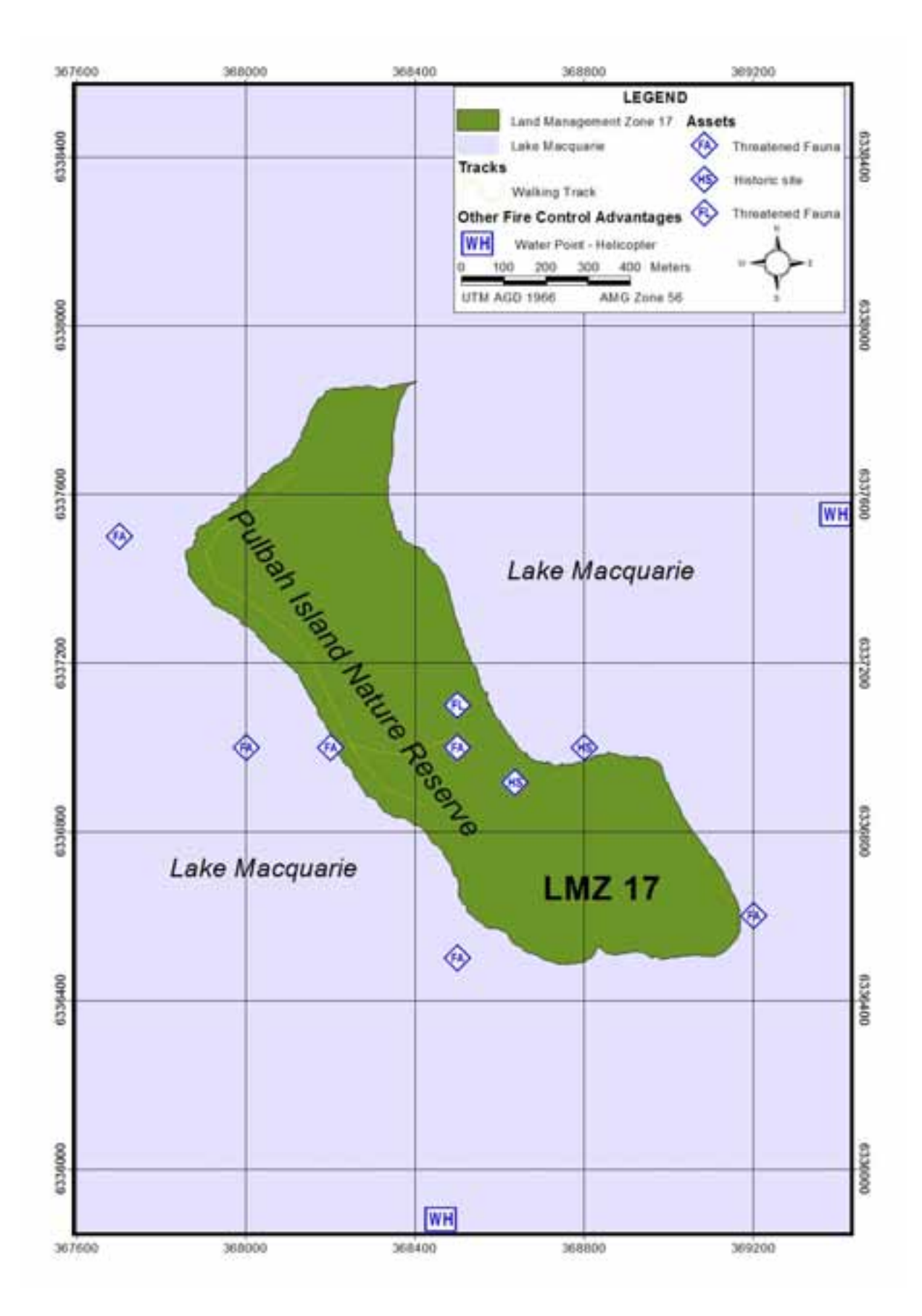
Figure 3: Fire control advantages, assets and fire management zones for Pulbah Island Nature Reserve.