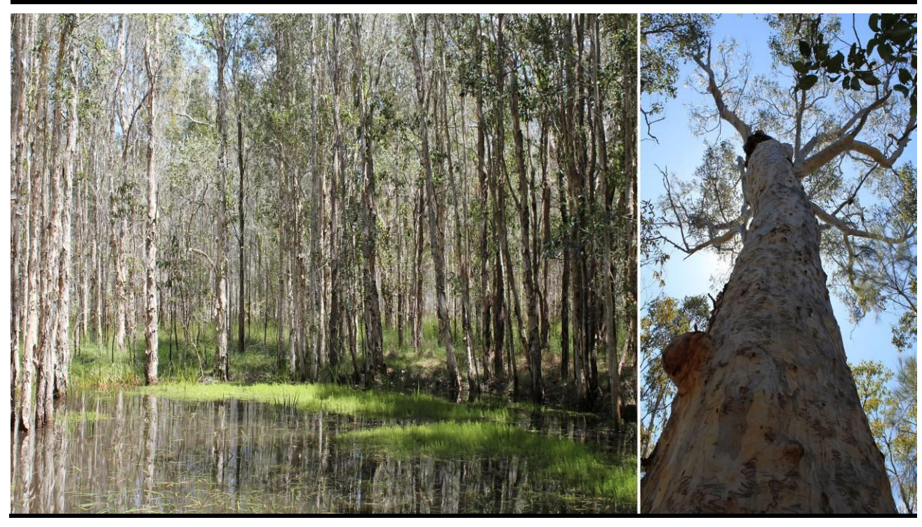
Tabbimoble Swamp Nature Reserve