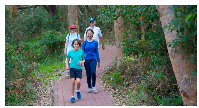
Photo: Bushwalking fun in Tomaree National Park