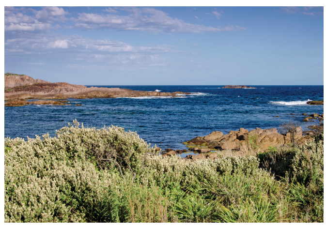
Photo: The rocky shoreline in Tomaree National Park

The Tomaree Coastal Walk is being delivered in consultation and will be sympathetic with local concerns and the environment. The proposal attempts provide a balance between conserving the park's natural and cultural heritage and recreational and commercial use.