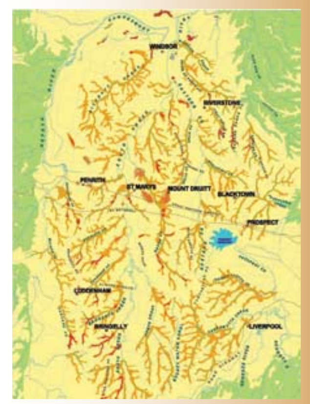
Draft Salinity Hazard Map for Western Sydney

When using modelling tools to generate salinity maps it is important to understand the limitations of generated data