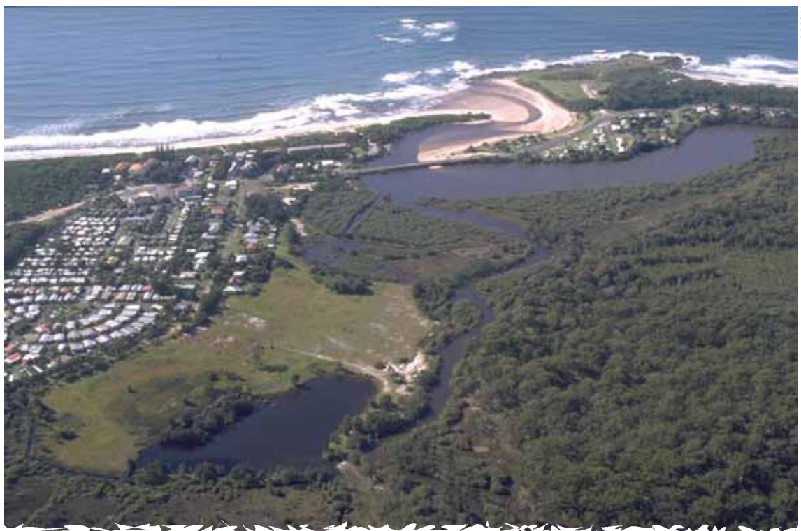
Cudgera Creek estuary, Hastings Point.

Where a CZMP addresses more than one estuary, or where CZMPs have been prepared for more than one estuary in a council area, consider estuary condition and vulnerability when deciding on management actions. For example, ICOLLs are typically more vulnerable to water quality impacts than drowned river valley estuaries.