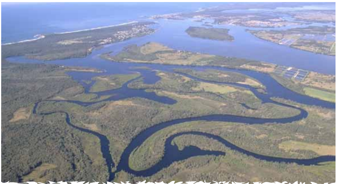
Clarence River estuary.

Guidance in this document has been structured to allow logical consideration of the Coastal Management Principles. Figure 2 provides a graphical representation of how the principles relate to the relevant sections of these guidelines.