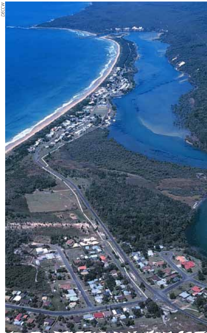
Woolli Woolli River estuary at Woolli.

Decisions on any coastal or flood protection works should consider any adverse impacts from the works, including increased off-site erosion or flood levels, reduced beach access and environmental impacts.