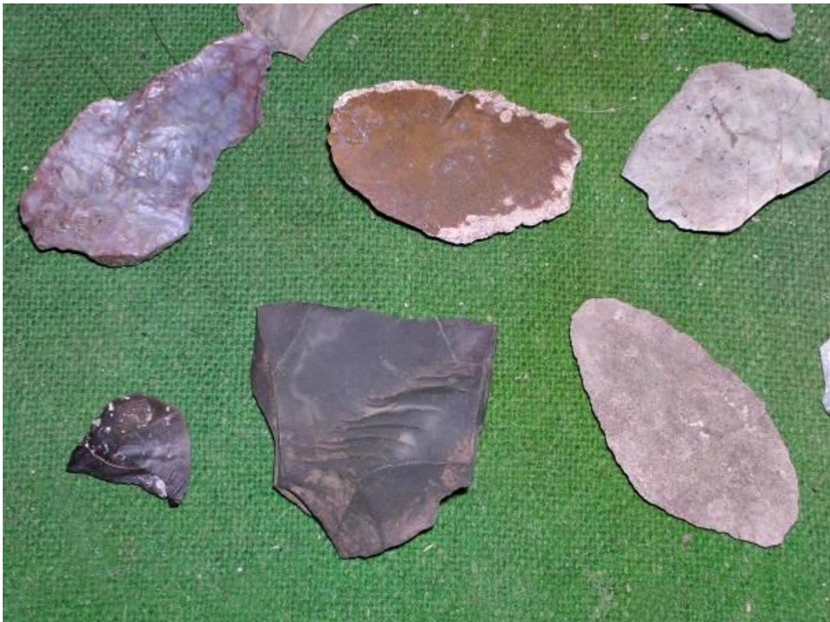
Stone Artefacts.

Stone artefacts are often small, so they can be difficult to protect. Erosion and weathering activities such as ditch digging and ploughing can disturb stone artefacts. They can also be broken when trampled by animals, or when run over by vehicles.