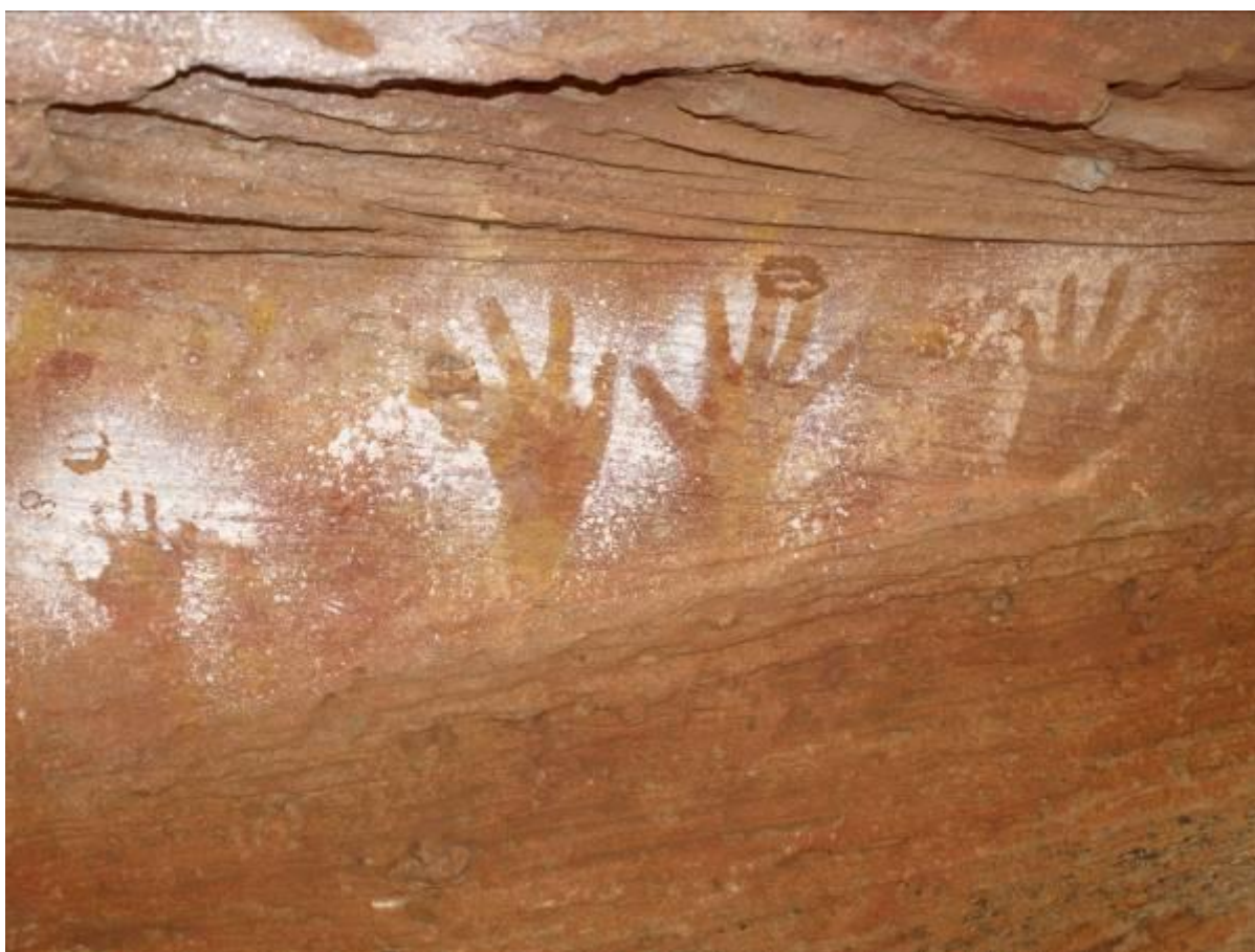
Mutawintji hand stencils.

Rock art sites can be easily damaged as they can be prone to erosion and vandalism. Touching rock art or disturbing a shelter floor in the immediate vicinity of the rock art can cause damage, as can movement on or over surfaces with rock art. Sites may also suffer from vegetation growth or removal. Effective management of rock art sites can include drainage, fencing, graffiti removal, and visitor control.