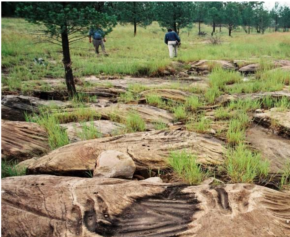
Axe Grinding Stones.

As sandstone is relatively soft, it is prone to weathering, erosion and trampling by animals. Human activities such as mining, road infrastructure, damming, clearing, ploughing and construction can also destroy these sites. Management options can include stock and erosion control.