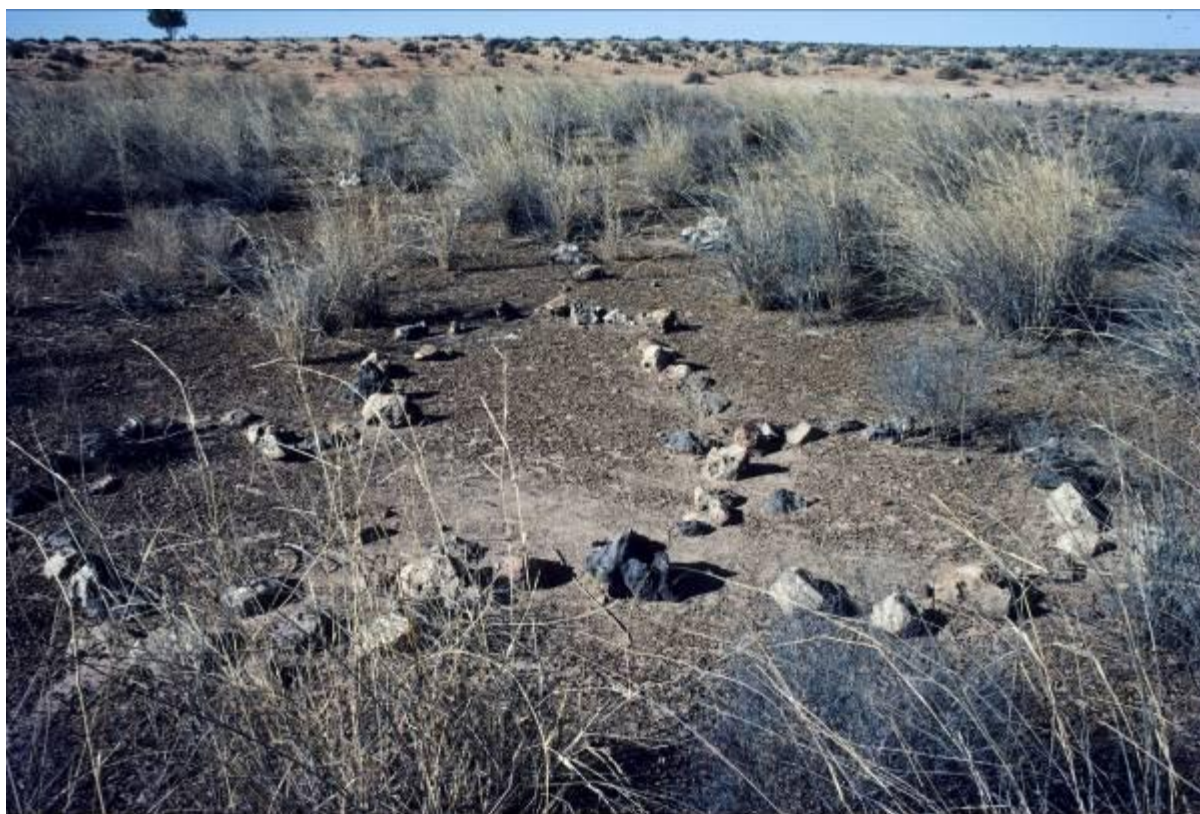
Stone Arrangement. Photo by M Sharp, DECCW

Management options around Aboriginal stone arrangements can include stock, weed and erosion control.