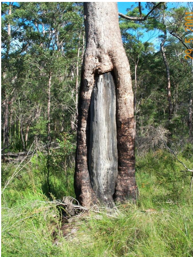
Carrington Scarred Tree.