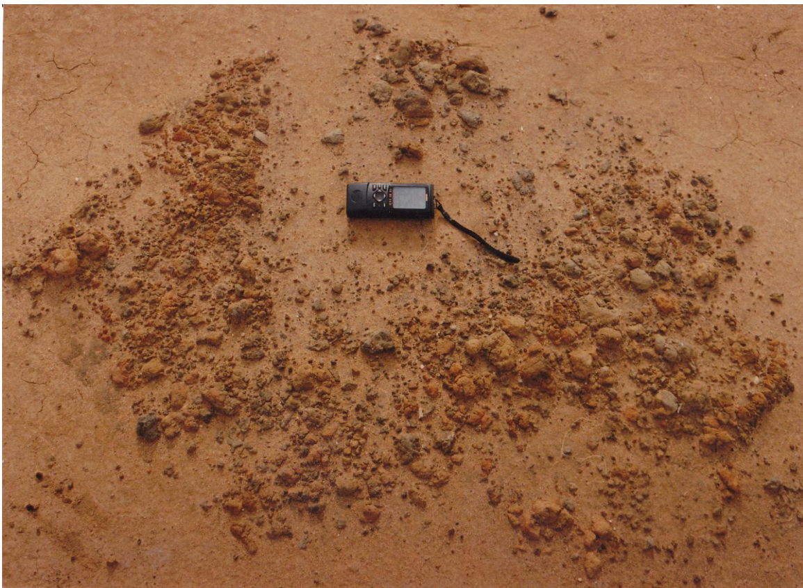
Hearth Site.

These hearths are roughly circular piles of burnt clay or heat fractured rock with associated charcoal fragments, burnt bone, shell and stone artefacts.