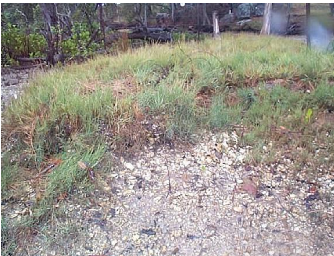
Shell Midden.

Middens are amongst the most fragile cultural sites. They can be exposed by wind or degraded by human and animal activity. Effective management of midden sites may include stabilising the surface, such as encouraging vegetation cover, or by restricting access to the site such as erecting fencing.