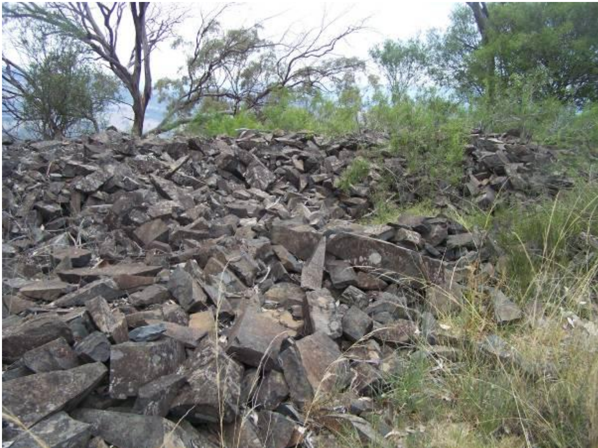
Daruka Axe Quarry, Tamworth.

Aboriginal quarries can be protected by management actions such as by controlling stock and managing erosion.