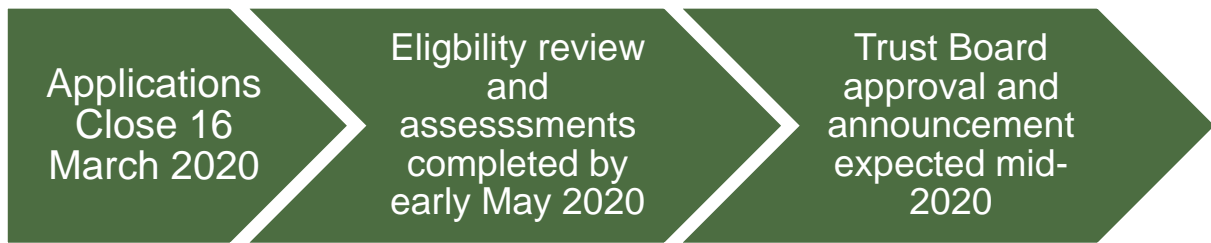
Figure 1 Timeline for Protecting Our Places application process

The program has a single-stage application process. Important dates for the program application process are set out below.