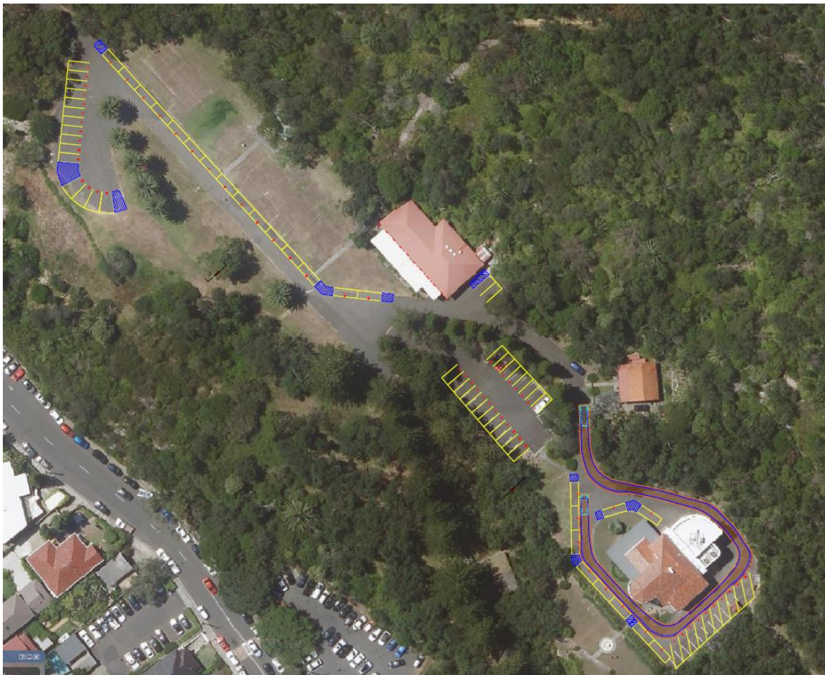
Indicative Parking Layout Plan

Parking for 33 Cliff Street, Constables Cottage and Green Point Cottage will be contained within the grounds of the cottages and is not anticipated to be more than two or three cars at most. Therefore having no impact on the existing parking capacities.