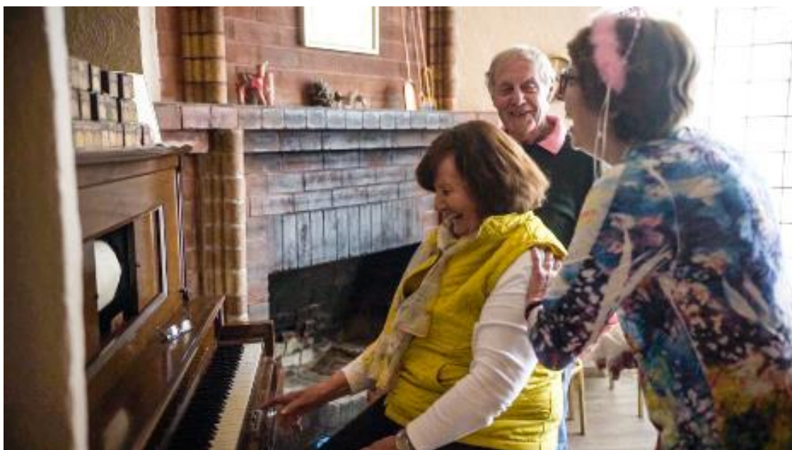
Previous Grant project: Community members learning about and enjoying heritage at the Malachi Revival.