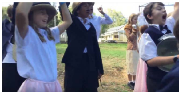
Previous Grant project: Students re-enacting historical events as part of the History Here project.