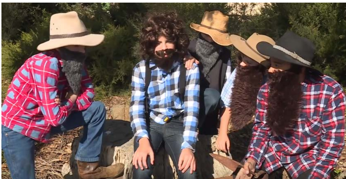
Previous Grant project: Students re-enacting historical events as part of the History Here project.