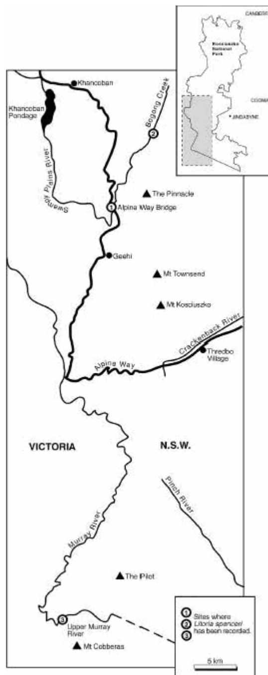
Figure 1: Sites where Litoria spenceri have been recorded.

Another population in the upper Murray River (site 3) was first detected in 1996 by Hunter & Gillespie (1999). Only one sub-adult frog was ever found at this location and repeat surveys of the same area have failed to locate this or other individuals (Hunter & Gillespie 1999, NSW NPWS 2001). All the evidence suggests that the density and size of this population was extremely low, and that it may now well be extinct in the wild (expert advice, 2008).